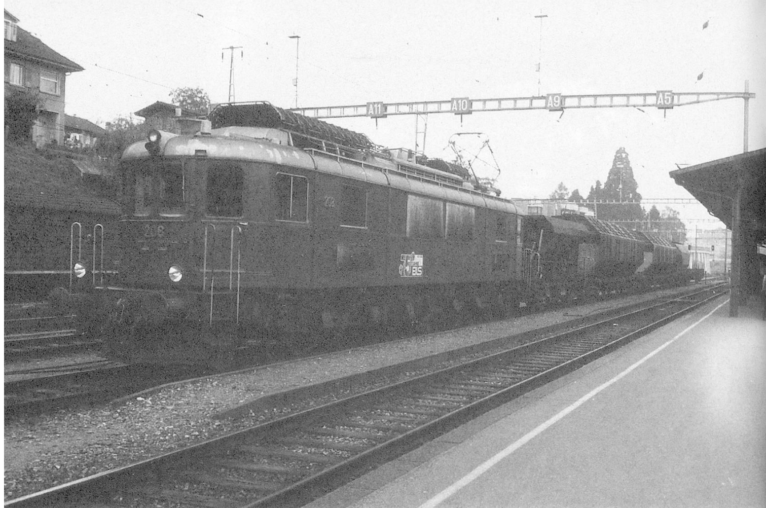
Above: The prototype.

"brass" manufacturers - Fulgurex, Metropolitan and Lemaco, and a disappointing cast-metal version from Roxy. Last year, Roco announced an HO model of this class, which is now available. First impressions are very good, with a perfect finish and superb, quiet running.