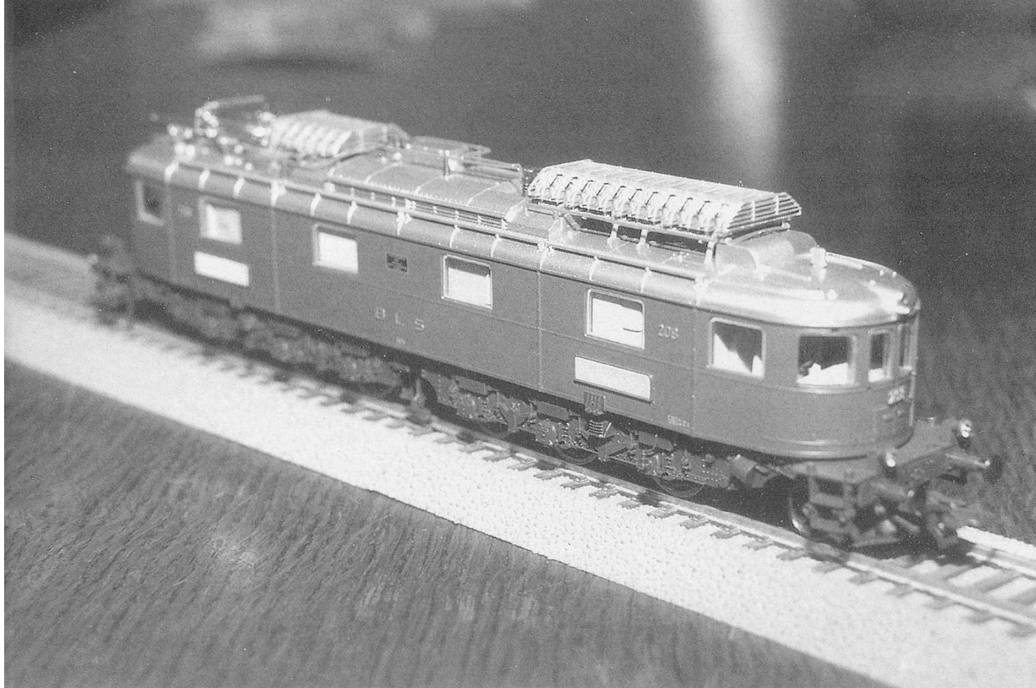
Above Left: The prototype at Spiez in August 1995.