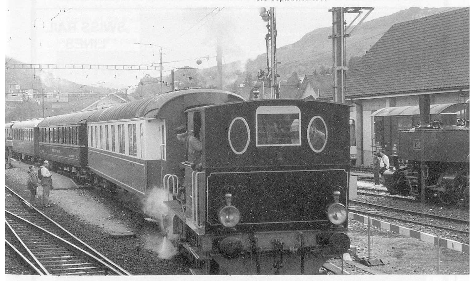
Below: KLB No. 1 leaving Balsthal station on Sunday 3rd September 1995