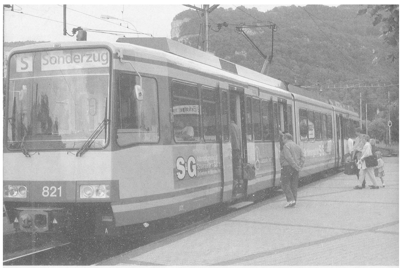
Above: Visiting Karlsruhe tram with SBB pantograph fitted, at Oensingen 2nd September 1995.

the SBB rail shop coach. This turned out to be a disaster for my wallet. They sold all items of SBB clothing so I now possess two SBB shirts, 3 different ties and my wife has a blouse, pullover and scarves. I resisted the station signs, lamps, posters and flags of all the cantons of Switzerland.