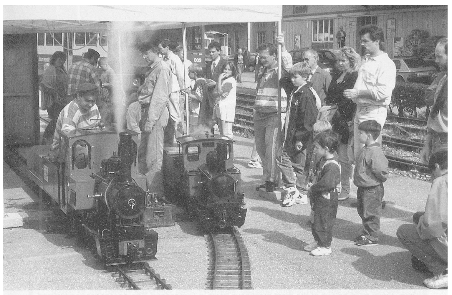
Above: Balsthal station had small live steam as well.