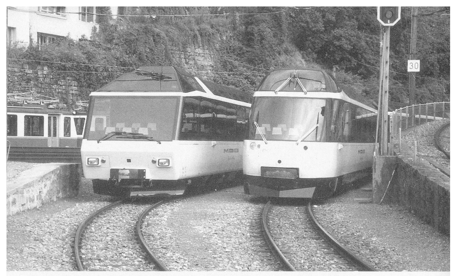
Above: The new Golden Panoramic on the left and the Crystal Panoramic at Montreux in the carriage sidings, these must be two of the most prestigous trains in Switzerland. The passenger comfort and ride is superb, offering tremendous views of the scenery. September 1995