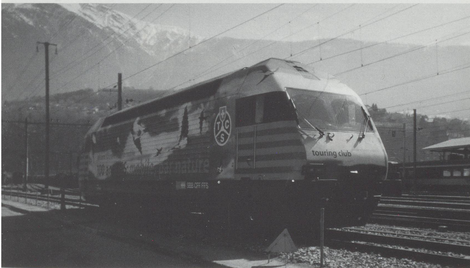
Below: The latest livery on Re460-022 for TCS seen here at Brig on 11th March 1996.