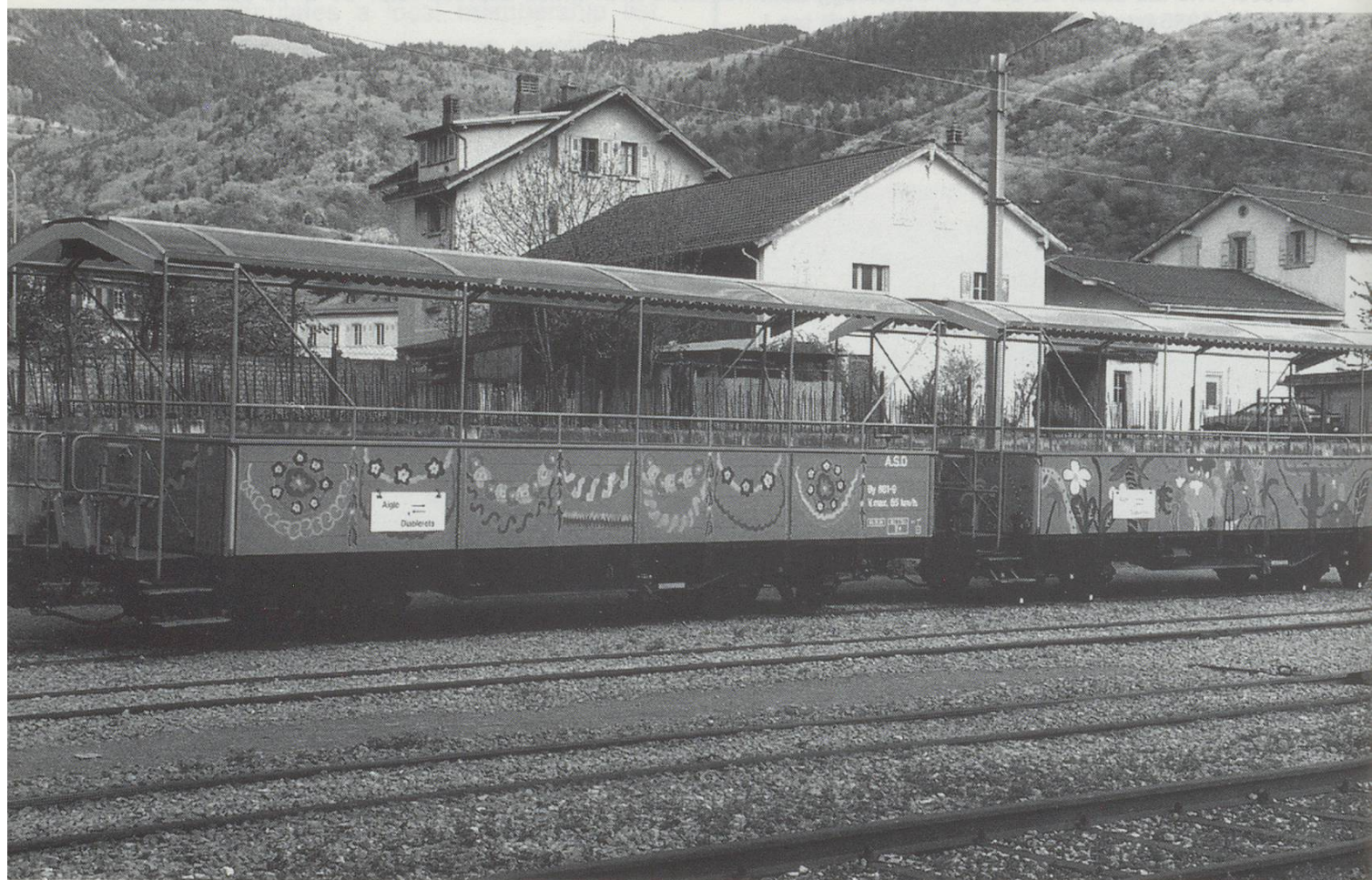
Below: The two open coaches obtained from the Brünig line now in service on the Aigle-Sepsey-Diableret (ASD)