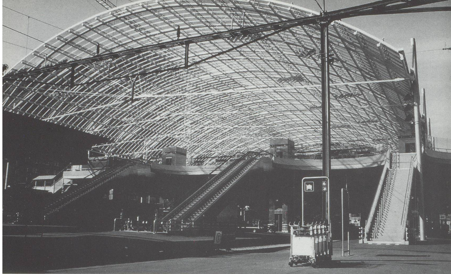
Above: The high level Post bus station that has been constructed over the main station at Chur.