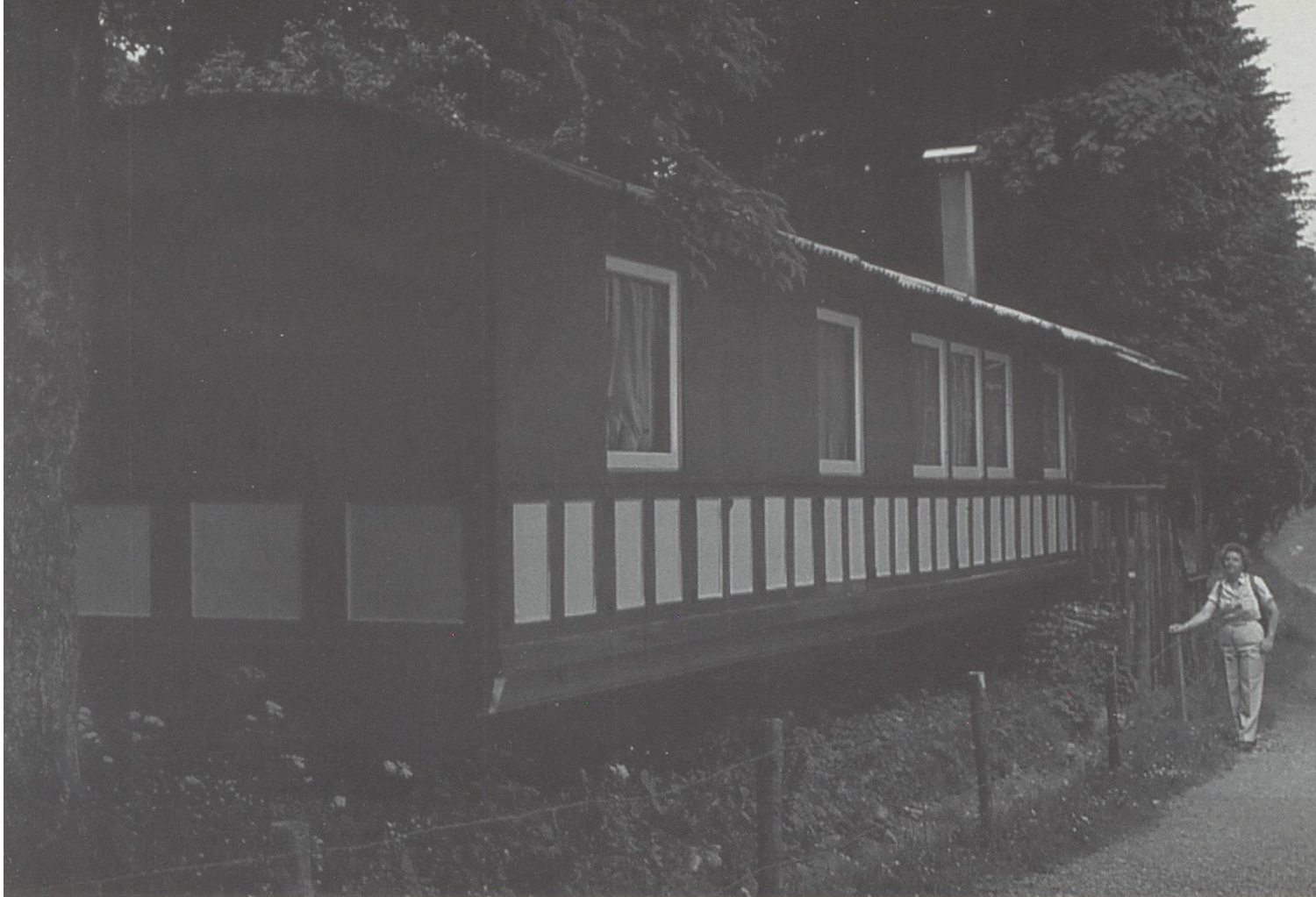
Above: The old coach of the Rigi-Scheidegg Bahn referred to in Swiss Express vols. 4/7 & 4/8 this photo was taken in 1985 by our member Michael Cross.