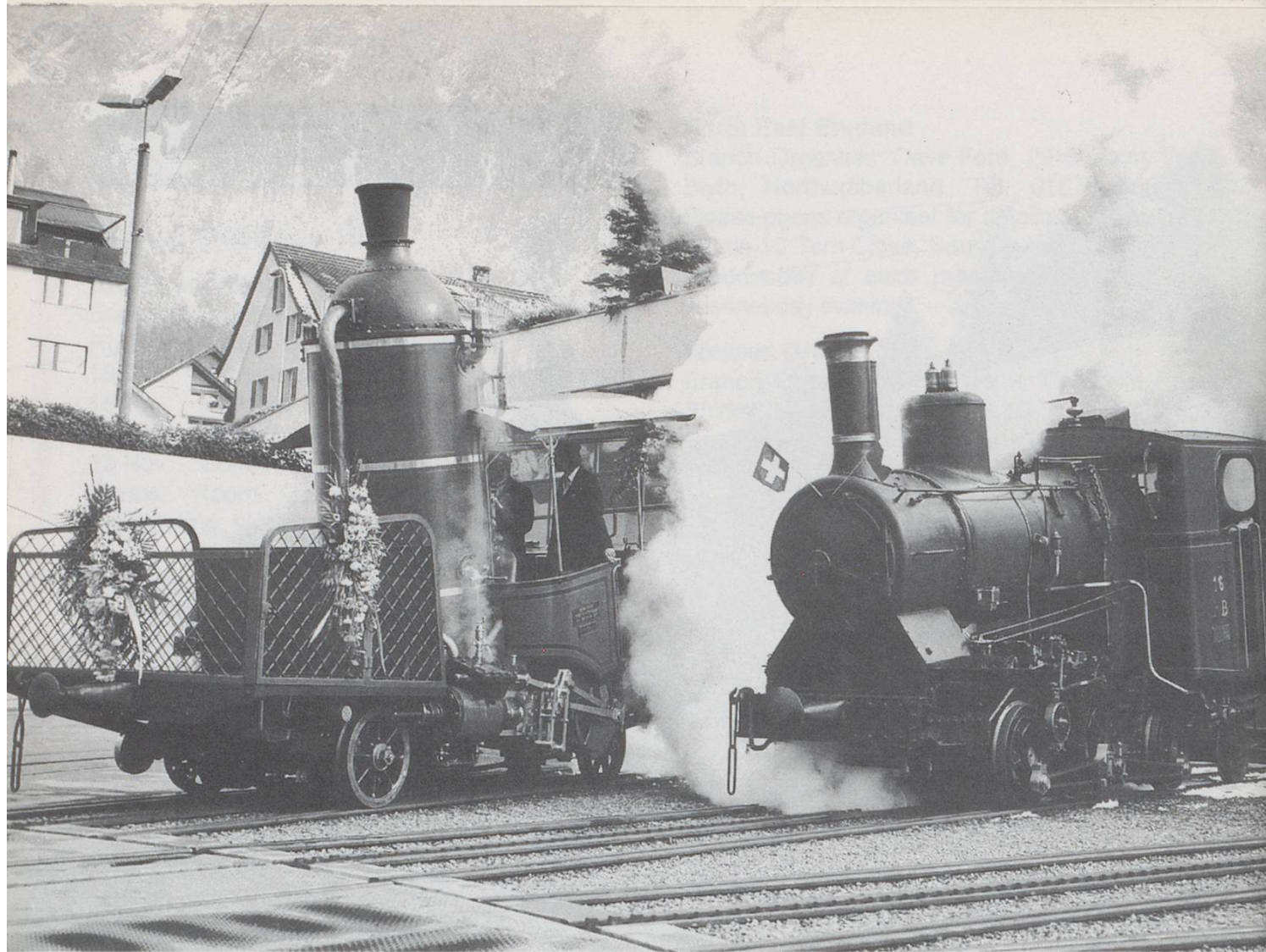
Previous page: No.7 near Rigi-Staffel with a special train in May 1996.