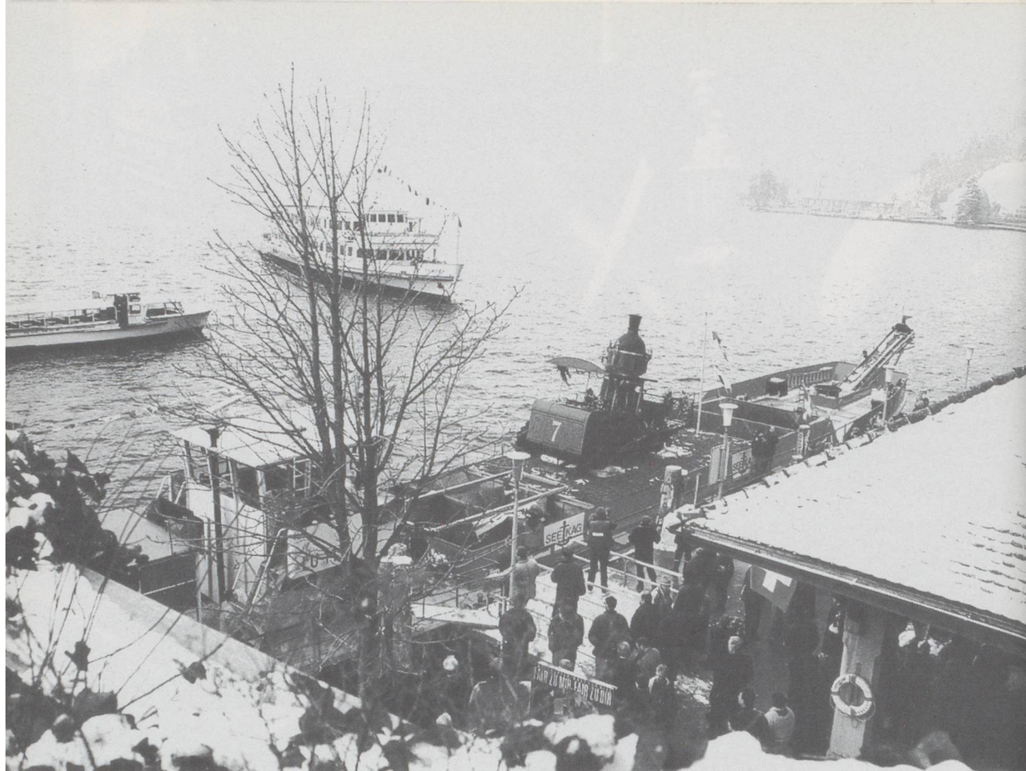
Above: No. 7 was delivered by boat from Luzern to Vitznau, where most of the village turned out to welcome the returning veteran.