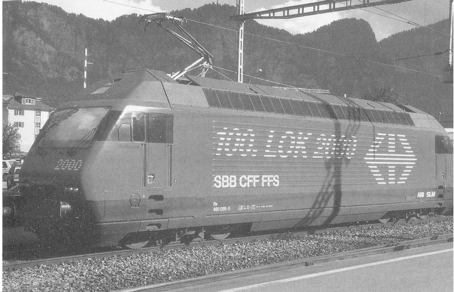
Above: Re 460 099 in the 100. Lok 2000 livery seen here at Landquart, September 1995.