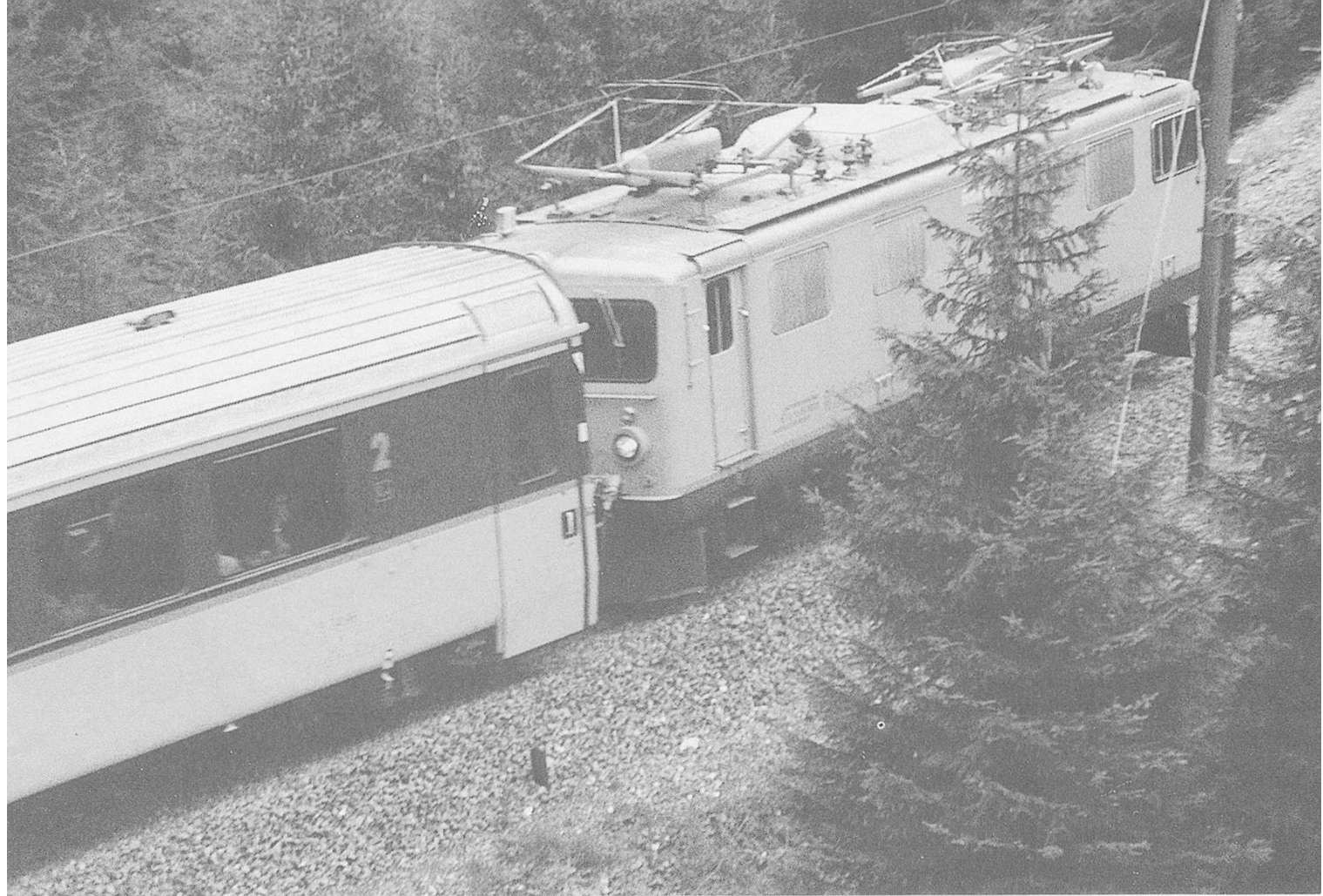
These three photographs of the Bernina Express , appropriately hauled by Ge4/4 I 602 Bernina , were taken from the same spot.