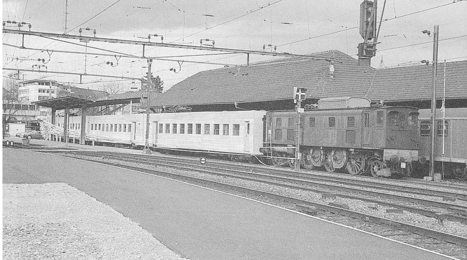
Ae3/6 II and timber-clad restaurant cars at Thun, December 1993.