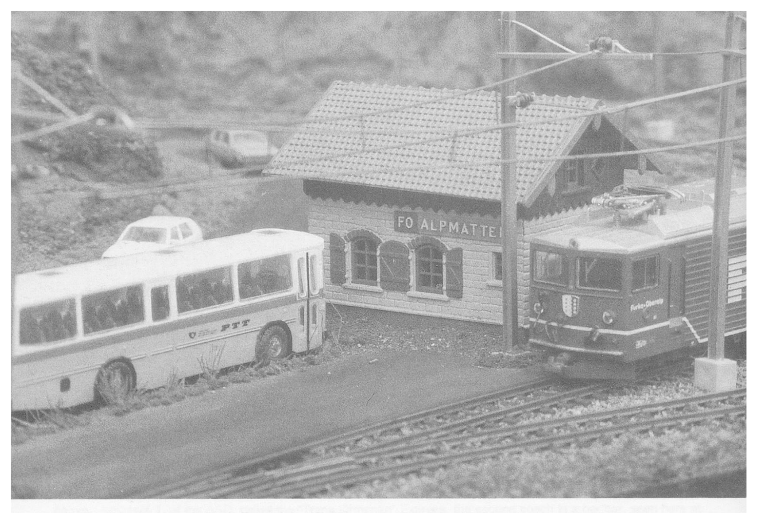
Above: First continous run layout, Bemo and Somerfeldt, again.

layout conveying the spirit of the St. Gotthard spirals would fulfil a wish to reproduce a part of the Swiss railway network in miniature. That was reinforced by the relatively large HOm layouts of Disentis and Filisur which were exhibited in various parts of the UK a few years ago. It was only when I saw several dioramas representing FO/RhB and SBB practice in the above magazine that it occurred to me that a considerable number of modellers in Europe prefer to produce well detailed dioramas (sometimes forming part of an integrated layout) rather than "complete" layouts. This became even more apparent on visiting model railway exhibitions in both Switzerland and Holland.