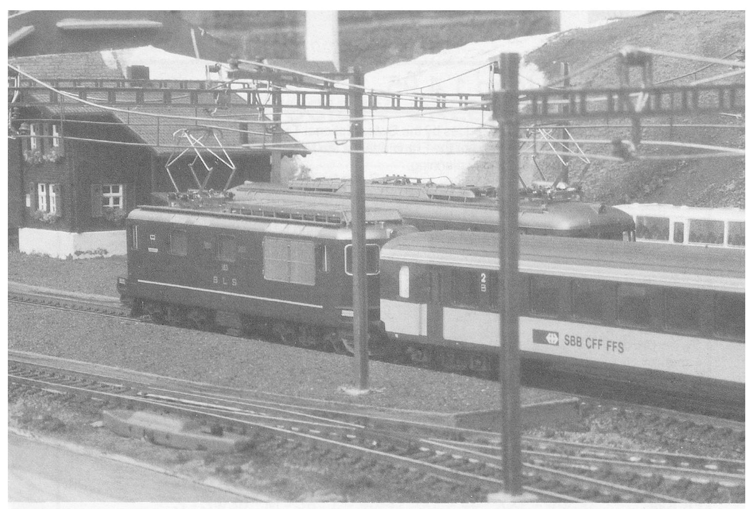
Above: First HO layout using Hag, Roco, Faller buildings modified and Sommerfeldt catenary.

in standard gauge stemmed from the erroneous notion that all that's typically Swiss should be modelled in HOm or Nm. Whilst it is evident that many modellers and prototype enthusiasts are drawn to the narrow gauge lines, the SBB or BLS standard gauge lines offer alternative constructional challenges and are now a refreshing change from the familiar HOm or RhB or FO layouts.