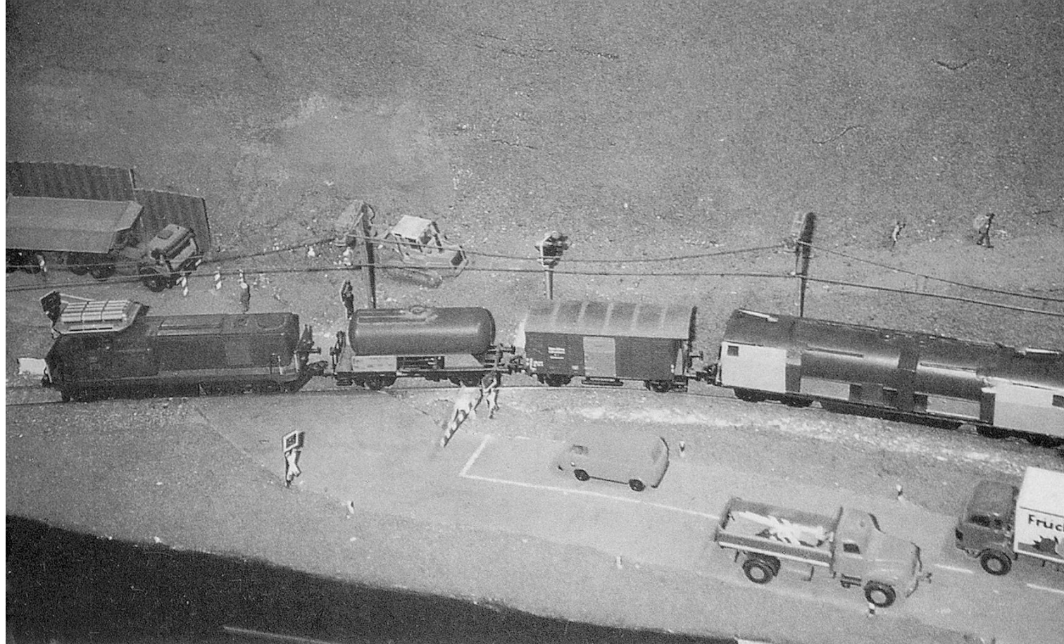
Left: Prototype of similar vehicle at 'Rorschach'.