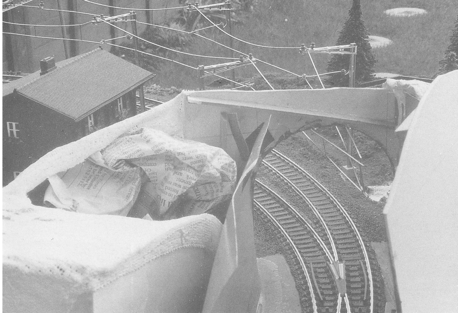
Above: The tunnel entrance on Alpatten 3. Three mm. card used as scenery formers, crumpled newspapers and Mod-Roc are evident to the left of this picture. Another view of this layout is in the Swiss Express, June 1995 issue, page 37.

green, brown or whatever. Again remove the excess (once dry) saving it for the next section to be treated.