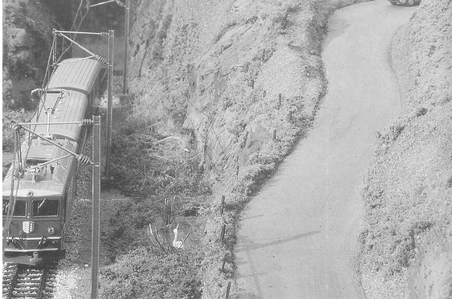
Above: The finished result of the diorama Alpatten 1 . Sommerfeldt catenary, Wiking VW Golf car, Bemo rolling stock and a Set Scenes swan in the small pond!

(generally the next day) the result is quite rigid although it is preferable to use newsprint, chicken wire or thick polystyrene as a support for the Mod-Roc or equivalent to give strength to the finished scenery - otherwise when holes are made for trees etc. the "topsoil" plaster impregnated cloth will suddenly seem rather fragile !