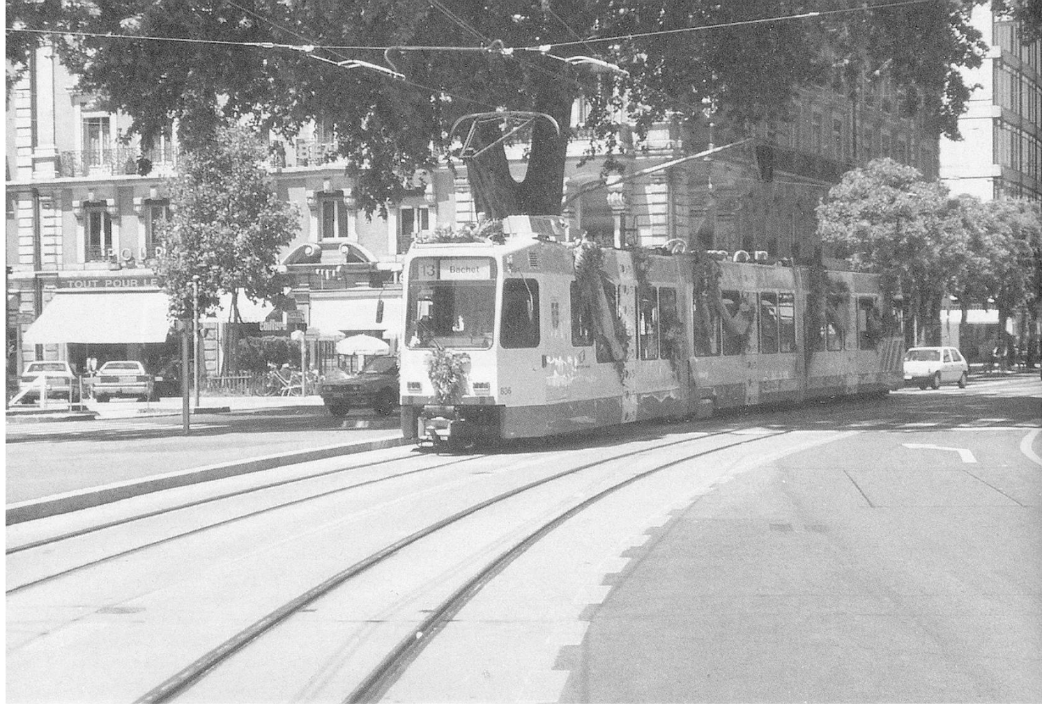
Previous page: The new Be8/4 tram 13 dressed for its inauguration run.