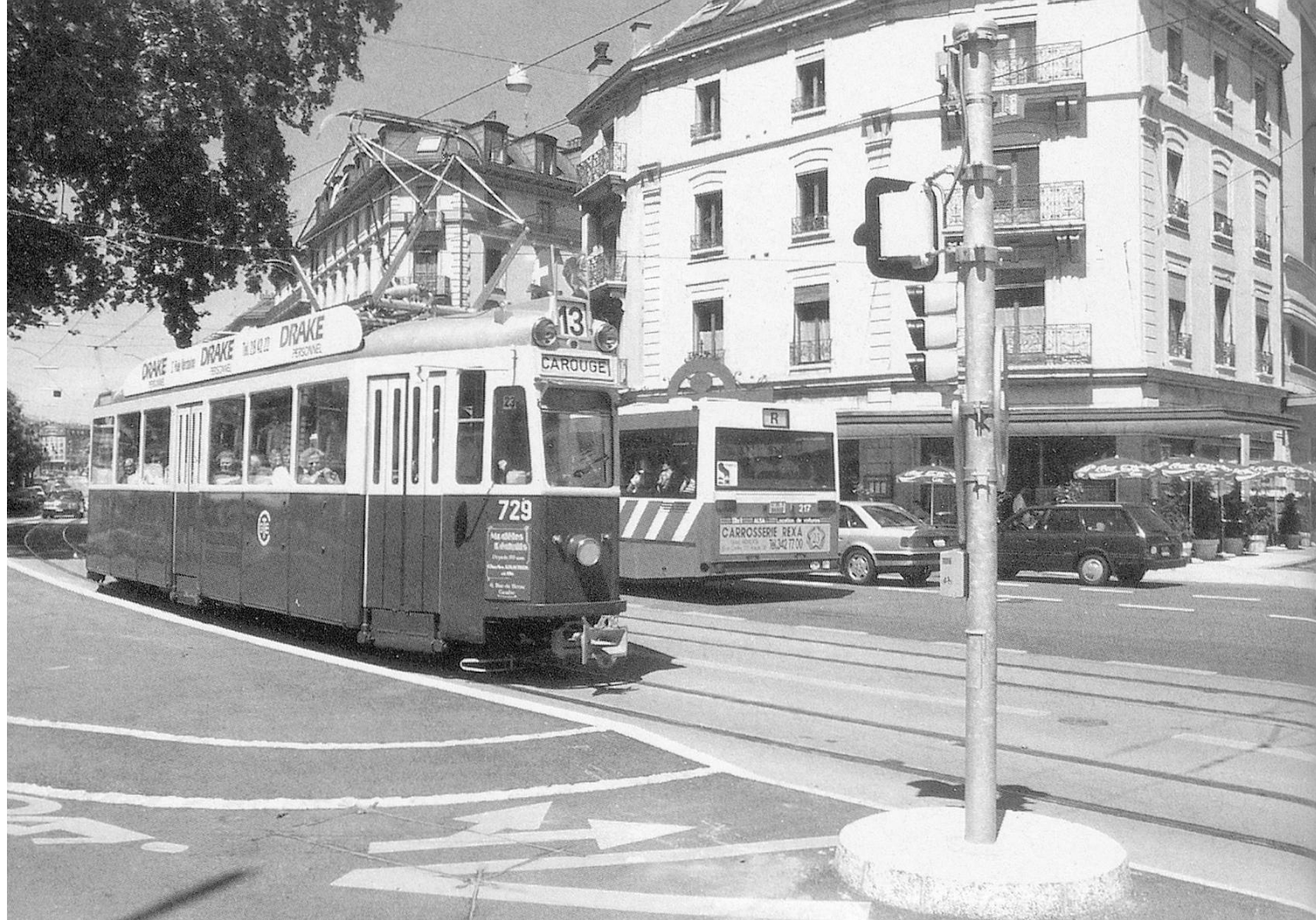
Above: Preserved AGMT No. 729, these ran between normal services.