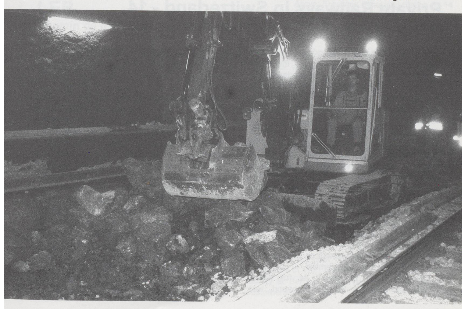
Swiss Express Volume 5/7 September 1998

Below: One of loaders at work: look at the close to; erance - the rail on the left is the "running rail".