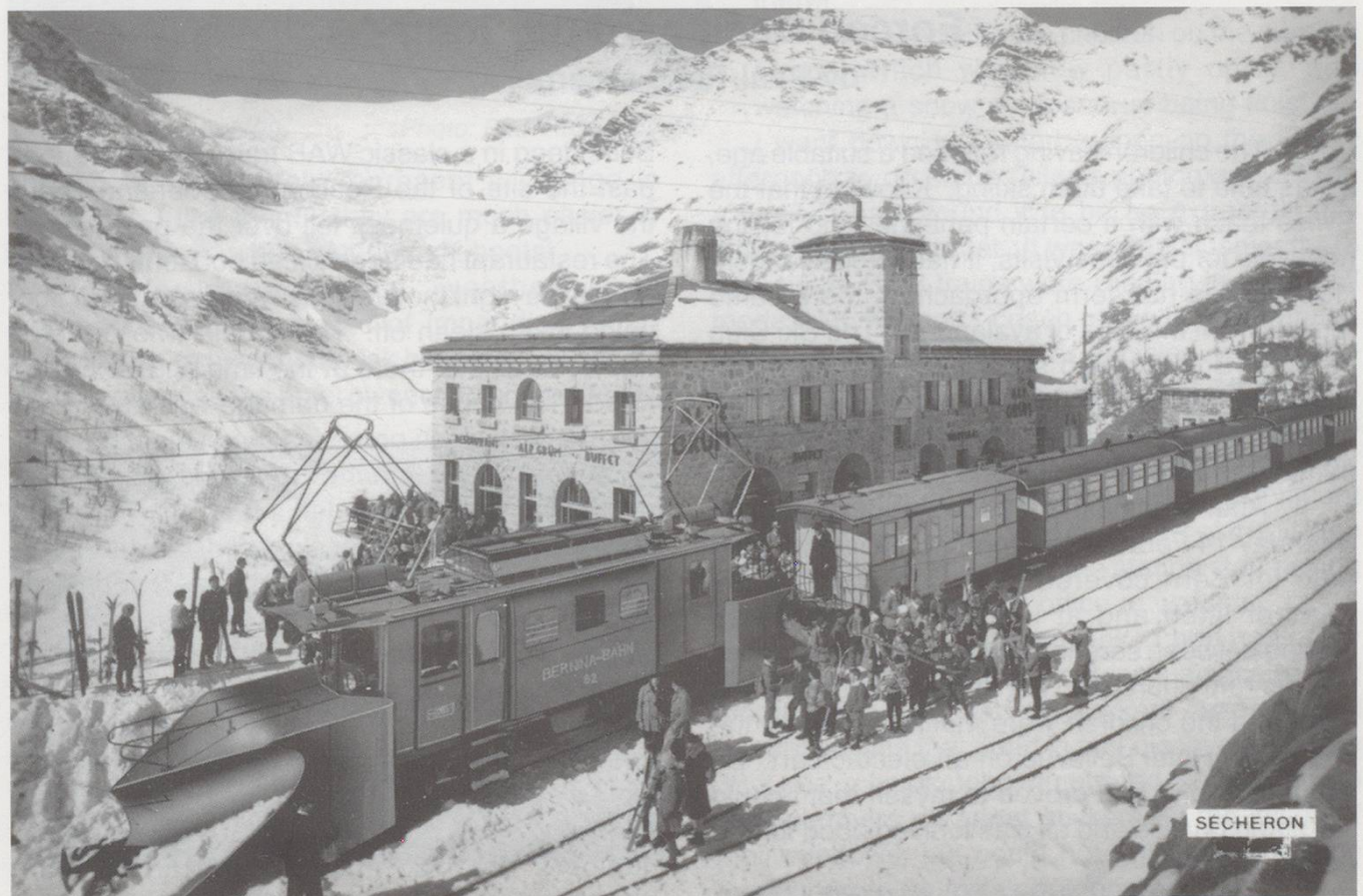
Alp Grüm: Bernina Bahn loco Ge4/4 No.82