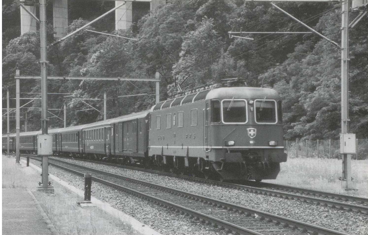
Although the Re6/6's are supposed to now be freight only they were still working many of the passenger trains over the Gotthard this summer. One example heads past the engineering gang store near Biaschina on a northbound semi-fast working. 19/06/99