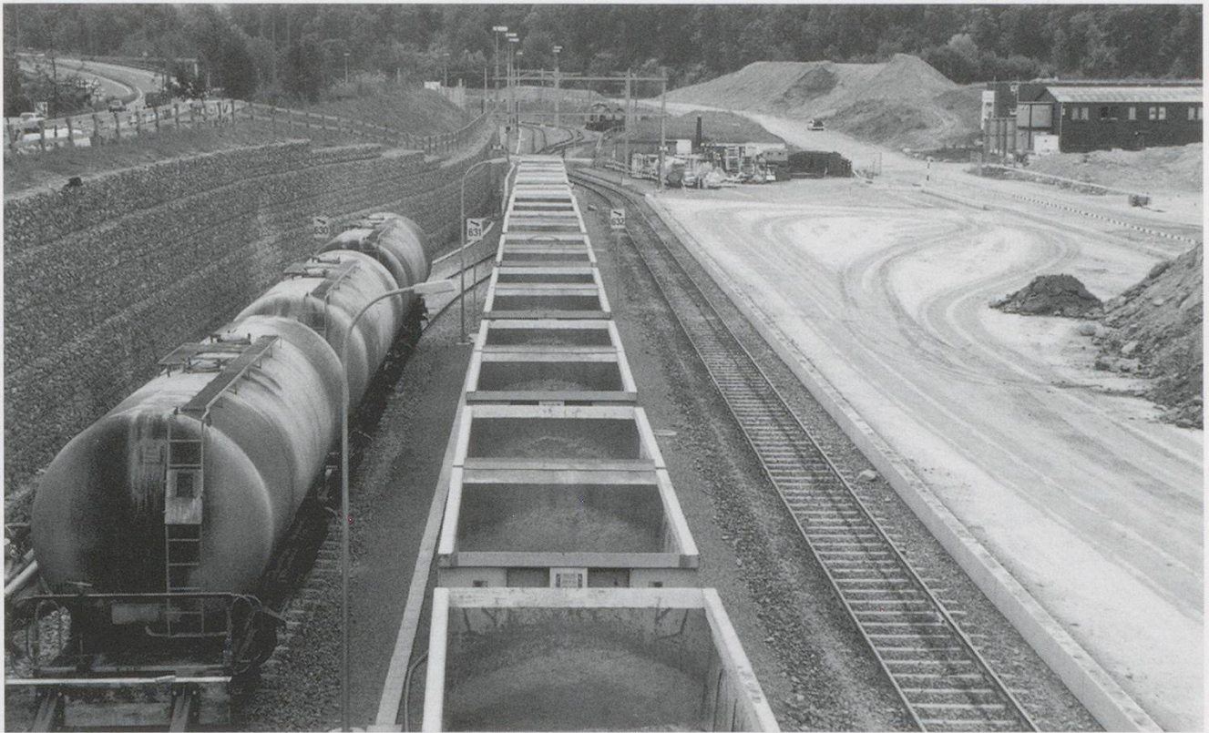
Part of the yard, transit sidings and spoil from the Zürich-Thalwill tunnel excavations. Two SBB Ae 6-6s can be seen in the distance. 30/6/99