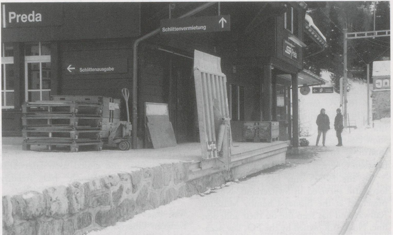
Above - the new docking ramp on the realigned east side loop at Preda Both pictures taken Christmas 1998 Below - Unloading toboggans from Abt1731 on the new ramp at Preda