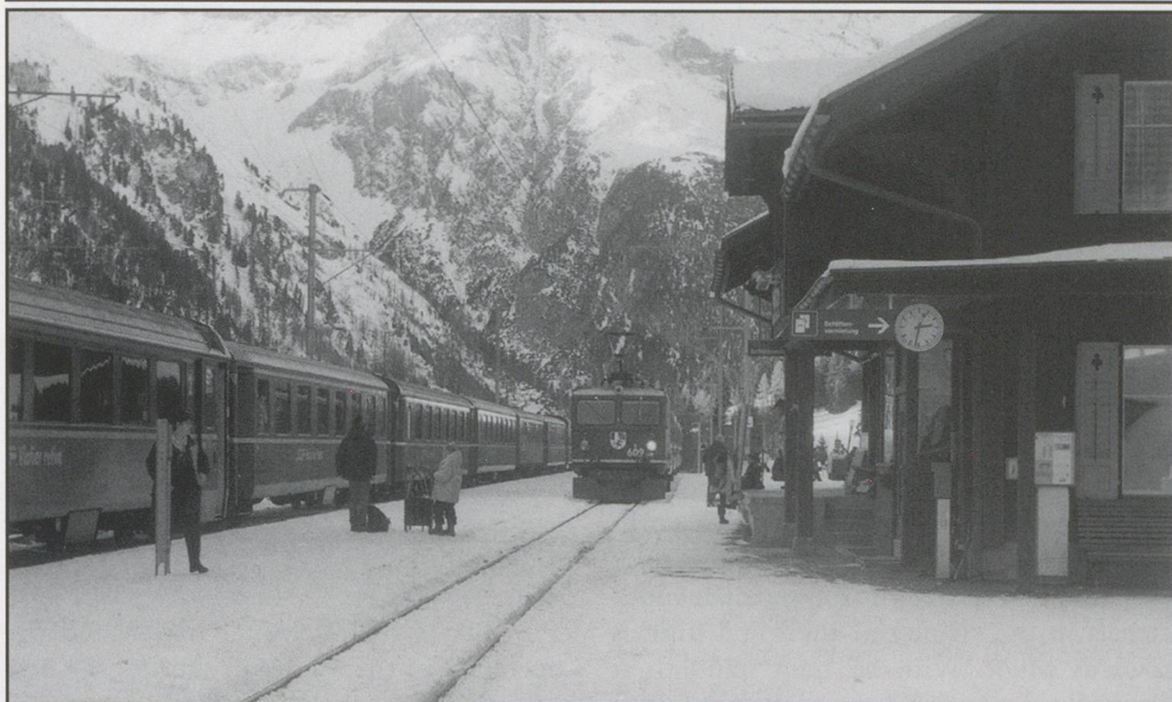
New 2 track layout (instead of 3) at Preda. The 1252 Chur-St Moritz is on the left and Ge4/41 No. 609 is on the right with the 4 coach push-pull toboggan shuttle waiting to return to Bergon. Xmas 1998

The three line note under the Rhätische Bahn heading in Notepad in the December 1998 issue referring to a new double line section between Bergün and Preda implied a somewhat more expansive addition to RhB track improvements than is really the case, for this is the most spectacular part of the Chur - St Moritz route involving major viaducts, four of them to-ing and fro-ing across the River Albula, and three spiral tunnels all within a crows flight distance of about a couple of miles.