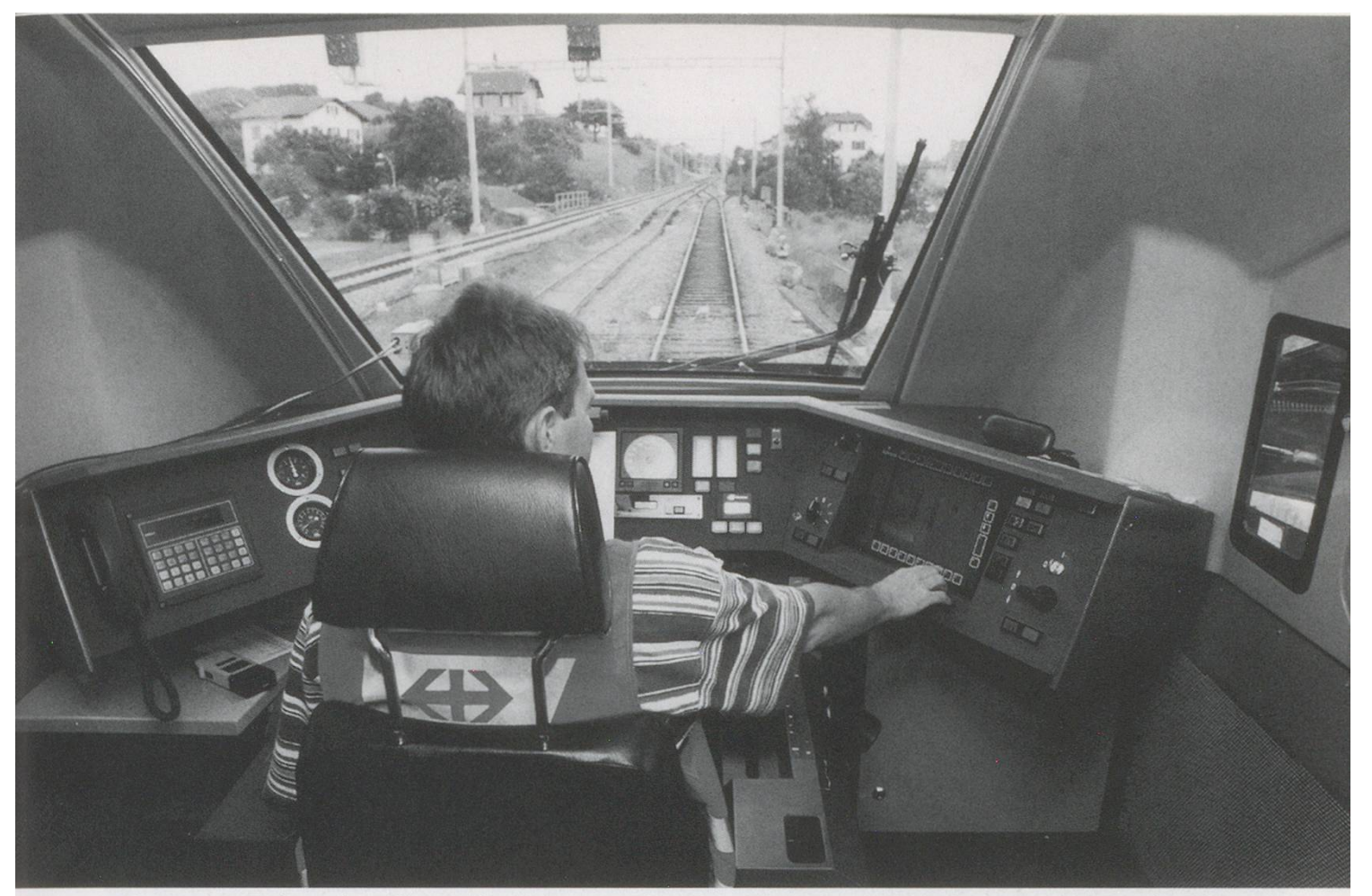
Above: A view from the cab. Just about the entire line along the Lake Neuchâtel is one continuous building site!

Below: One more stage completed! Freshly baptised (with the local wine of the same name, the "caves" of which can just be seen on the left, above the tunnel) locomotive 460 059 9 "La Beroche" breaks the ribbon