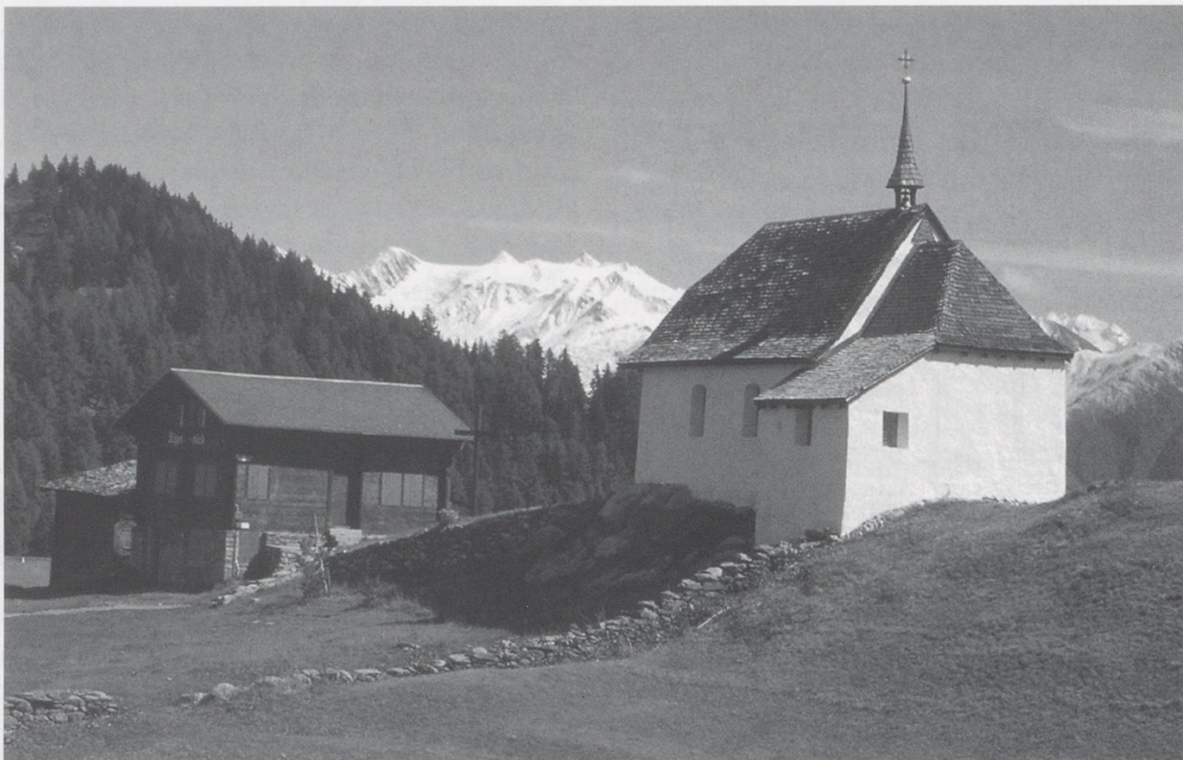
The picturesque Chapel at Bettmeralp