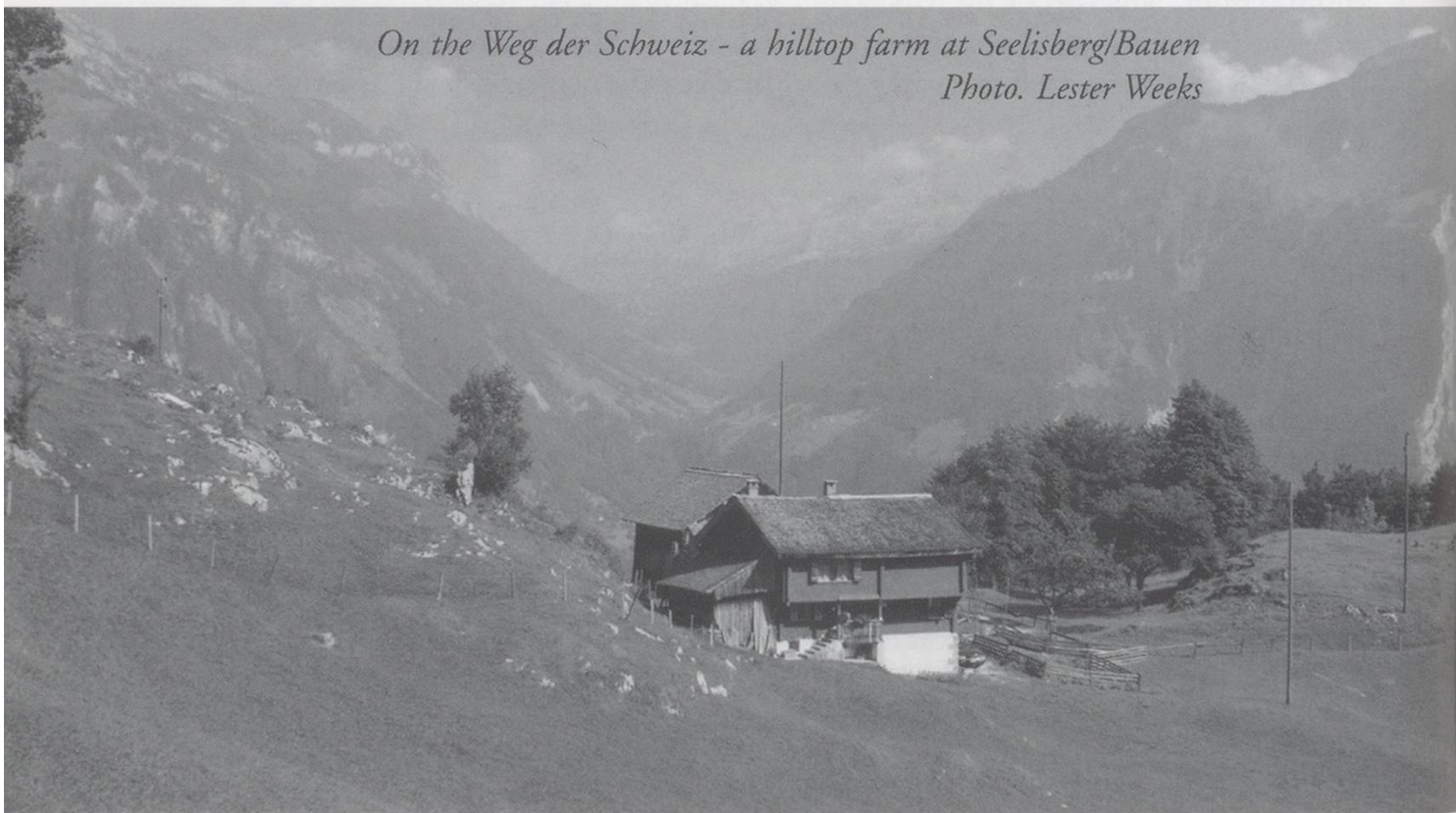
On the Weg der Schweiz - a hilltop farm at Seelisberg/Bauen

This 35-km path around the Urnersee (a part of what we know as Lake Lucerne) was laid to commemorate the 700th anniversary of the founding of the Swiss Confederation in 1992. It was paid for by the Cantons proportionately according to population. It runs from Rütli+ to Brunnen+ and is very well signposted. A lot of it is more or less level, but some parts are physically quite