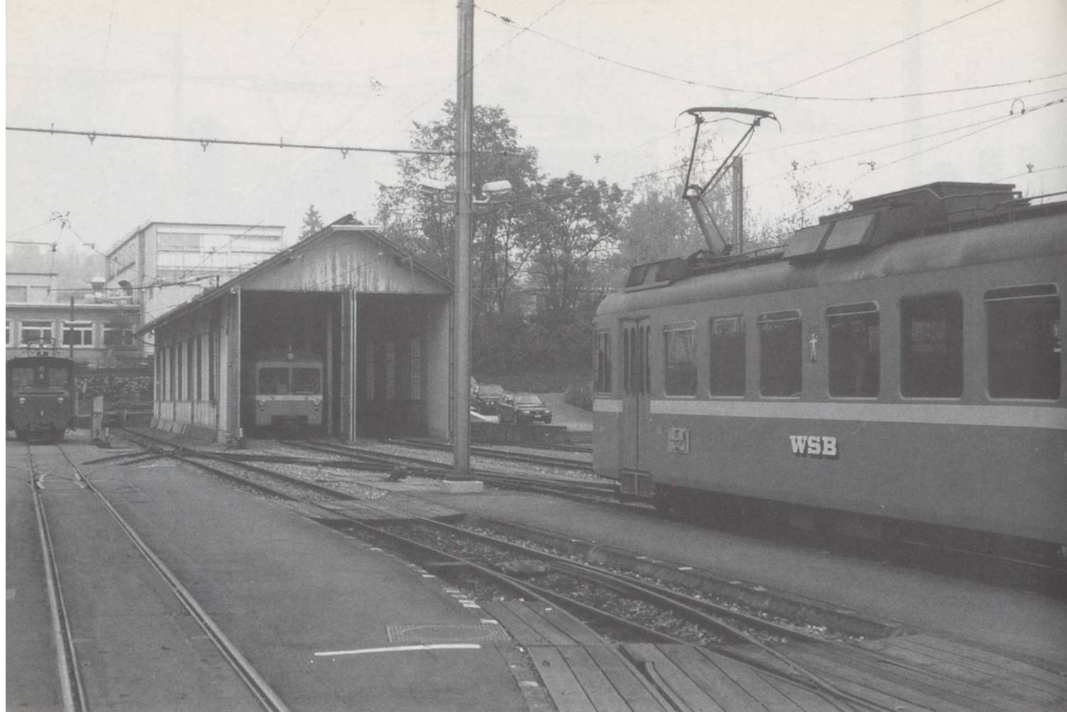
Above: Be4/4 No. 23 at Menziken-Burg 25/10/96.