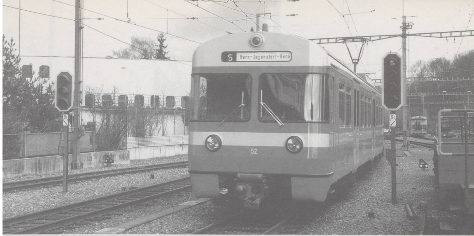
Above: Be 4/8 No. 52 at Worblaufen 2/3/96