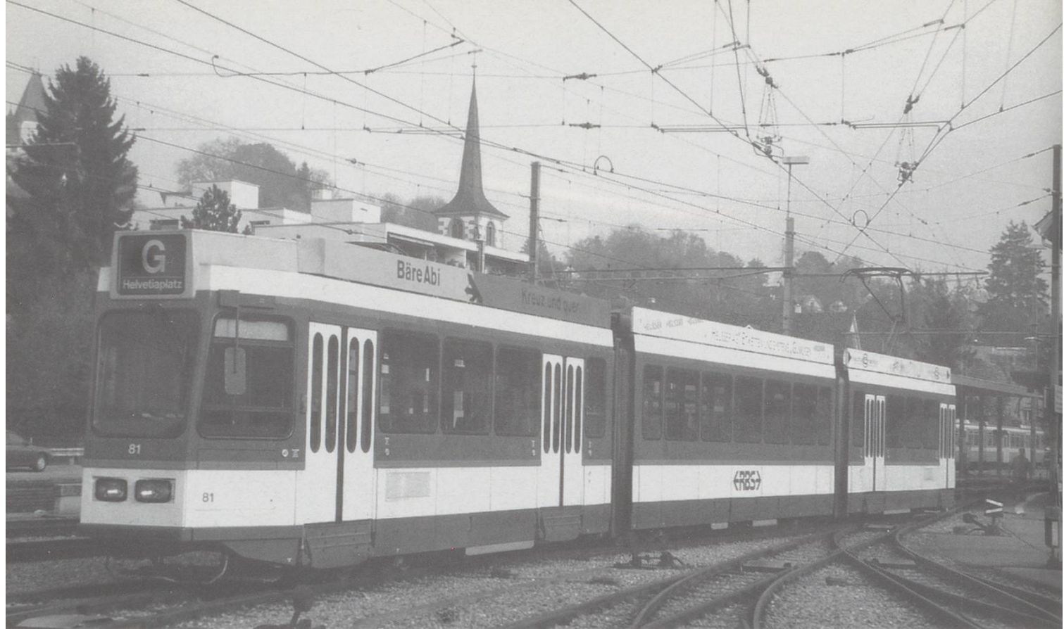
Above: Be 4/8 No. 81 at Worb Dorf, 25/10/96