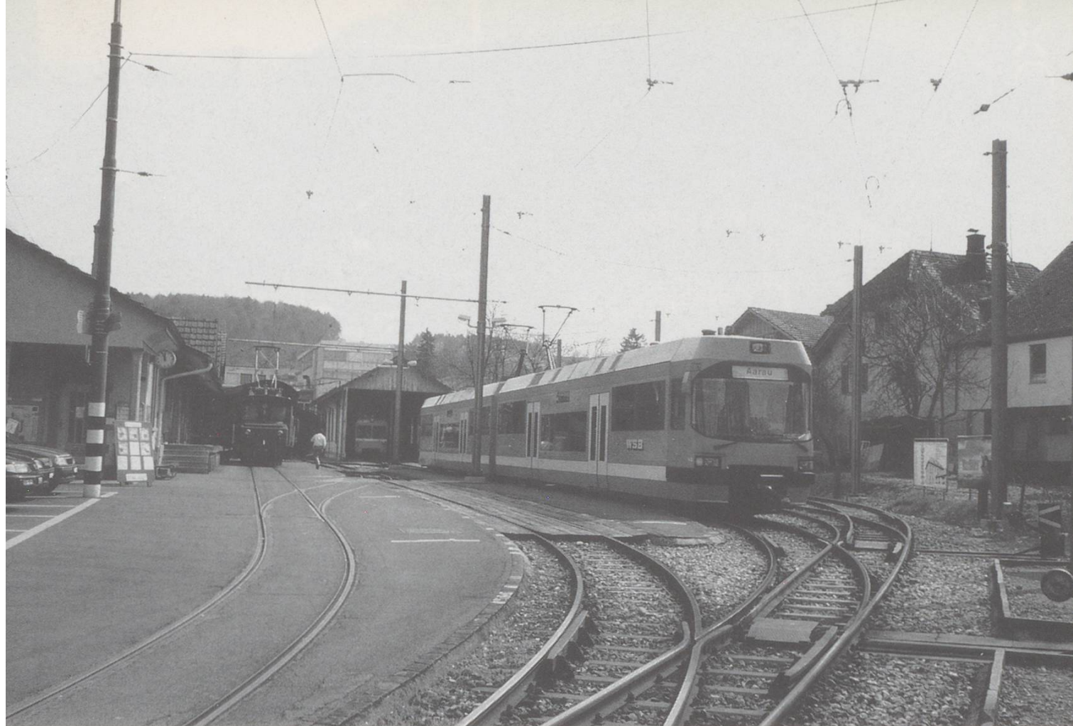
Above: Be4/4 No. 32 at Menziken, 17/4/96

standard gauge wagons mounted on rollbocken with transfer being made to or from the Federal Railways at Suhr. Here the WSB uses a 1915 electric shunting locomotive which in itself merits a stop off to find and perhaps photograph. As well as the regular freight and passenger services the WSB operates special saloon trains for hire which are either hauled by a beautifully restored railcar (No.116) or a special liveried shunter (No.47).