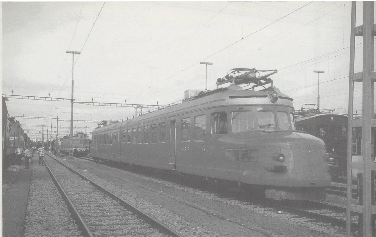
Above: RAe 4/8, Double Red Arrow, in the exhibition

time of the first thunderclap the full SBB Orchestra who were playing in the hall struck up Johann Strauss's "Thunder and Lightning Polka" to much amusement. It somehow summed up the occasion, festive, and not overburdened with officialdom.