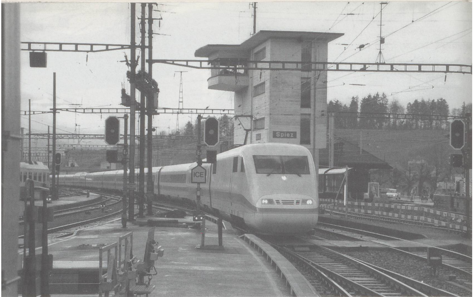
Above: An ICE train approaching Spiez station