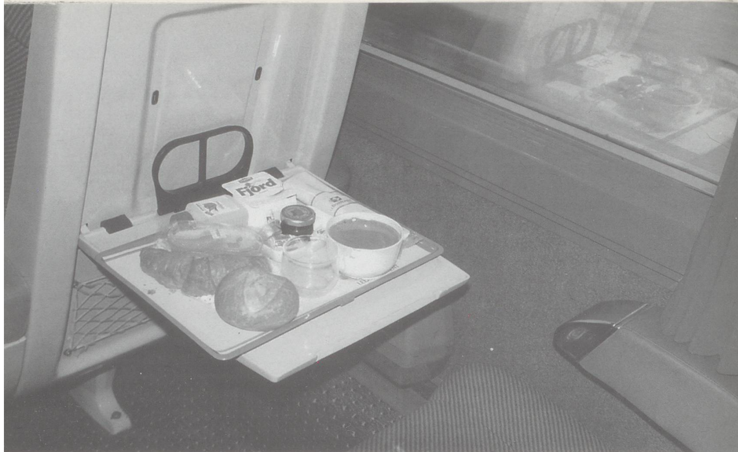
Above: TGV Paris - Bern service: Breakfast served at your seat, but you have to pay for it separately.