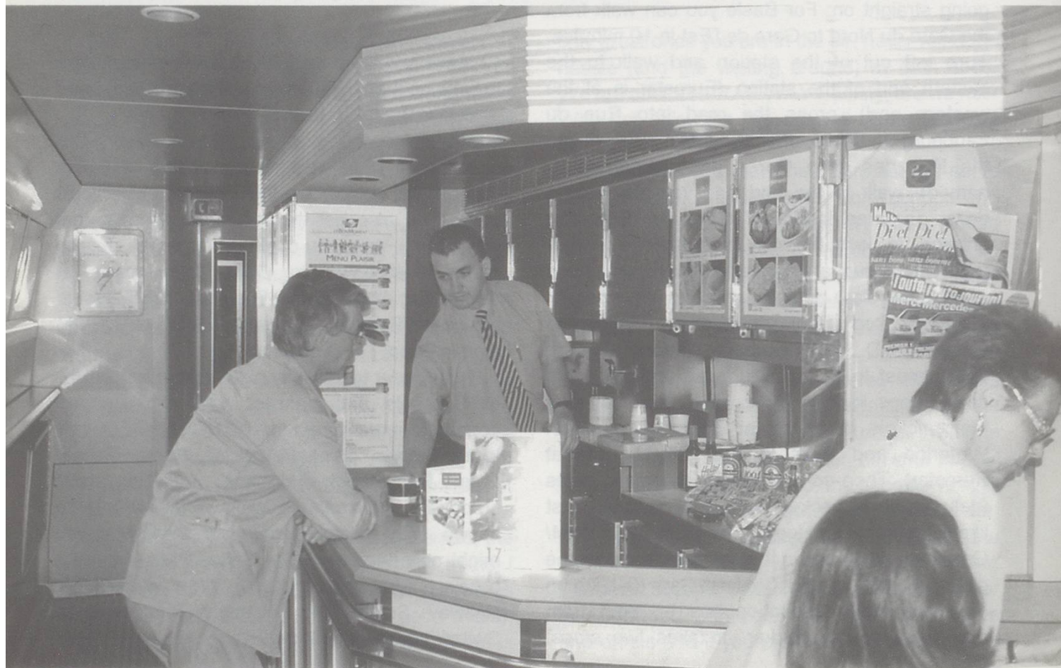
Below: TGV Paris bern service: The Bar (usually car 14 or 4, depending on you train) serves hot and cold drinks, snacks and French magazines.