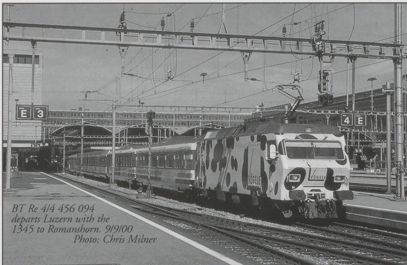
BT Re 4/4 456 094 departs Luzern with the 1345 to Romanshorn. 9/9/00