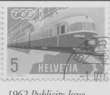
1962 Publicity Issue Trans Europe Express

classic TEE unit and the 50th anniversary of the Lötschbergbahn was covered in 1963. Subjects have also included Zürich trams and S-Bahn, 100 years of the RhB and, of course, the 150 year celebrations of 1997 which depicted trains over the years with passengers in period dress.