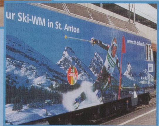
Two views of BT Re 4/4 456 094 in the special WTM St Anton livery as mentioned in Notepad.