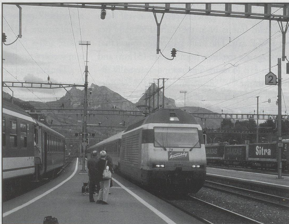
460021 arrives at 15.08 on the Milan-Dortmund "Verdi". The connecting Chiasso-Schaffhausen semi-fast which arrived at 15.04 is adjacent behind Re6/6 11656. One of the few Sunday intermodals is held on a through loop on the right. The scene is dominated by the twin peaks of the Mythen. 09/07/2000.

more scenic single line route close to the shores of Vierwaldstättersee which it follows from Küssnacht am Rigi. A cross platform interchange is advertised between the two main line trains, the IC service departing first at 11.52 fol-