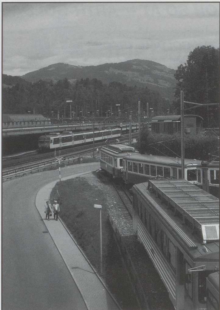
An SBB560 EMU on a local to Luzern via Küssnacht waits departure. A selection of RigiBahn stock is stabled in the foreground. The picture was taken from the RB platform. 09/07/2000.

Luzern having passed by the lake which has hosted the World Rowing Championships (and where you will never ever be able to glimpse Sir Steven Redgrave in a boat again!), Rotkreuz and Immensee, while the other will be travelling along the single line on the east bank from Zürich HB via Zug. The train from Luzern is a Basel - Chiasso service, calling at all but the smaller stations en route, arriving A-G at 11.46. The train from Zürich is an IC service from Schaffhausen to Milan calling only at Bellinzona, Lugano and Chiasso, arriving two minutes later at 11.48. Between these two arrivals an IR "Voralpen Express" service from Romanshorn and St Gallen arrives from the Rapperswil line at 11.47. After just a one minute stop it departs for Luzern but from Immensee takes the