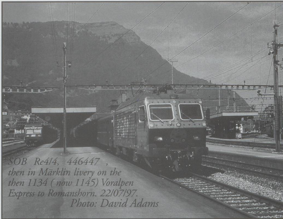
SOB Re4/4, 446447 , then in Märklin livery on the then 1134 ( now 1145) Voralpen Express to Romanshorn. 22/07/97.

make for an interesting shot. I remember being there between 10.30 and 11.10 one weekday morning when the only freight moving was a Lokoop 477/9 shunting a few wagons in preparation for a trip to Samstagern. These included one bogie wagon carrying household waste containers that had been tripped from Erstfeld, I believe on the rear of an EMU.