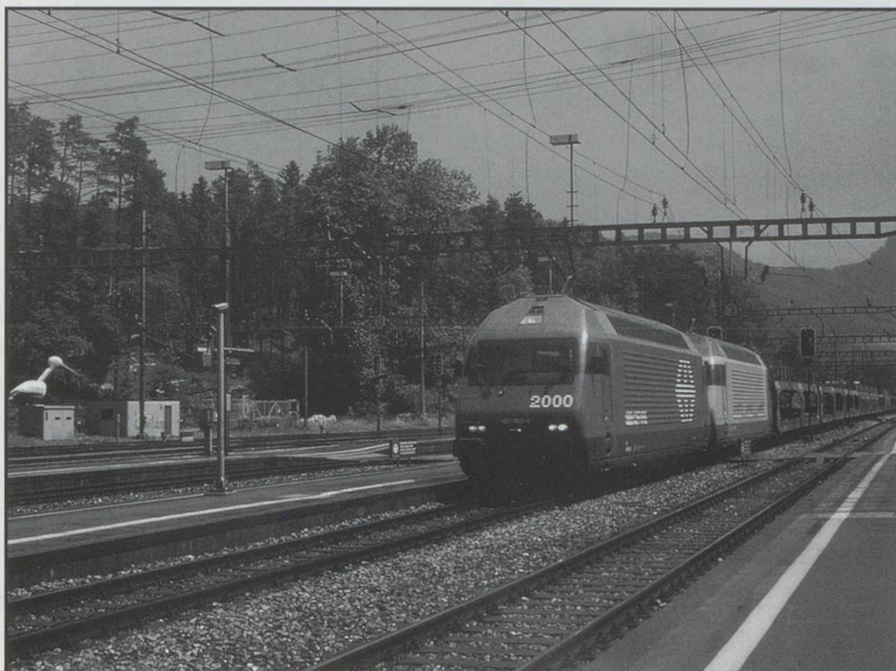
460090 and 460070 pass on a N/B freight. It has crossed to the normal S/B line to allow a local ex Luzern to run wrong line in the opposite direction into the platform on the right. 04/07/2000.

between three designs of Re4/4s, those of the SBB, SOB (former SBB 10101-4) and BT which normally work in push and pull mode with the loco at the Romanshorn end, usually two of each type covering six diagrams with only a 7 minute turn round time at the latter.