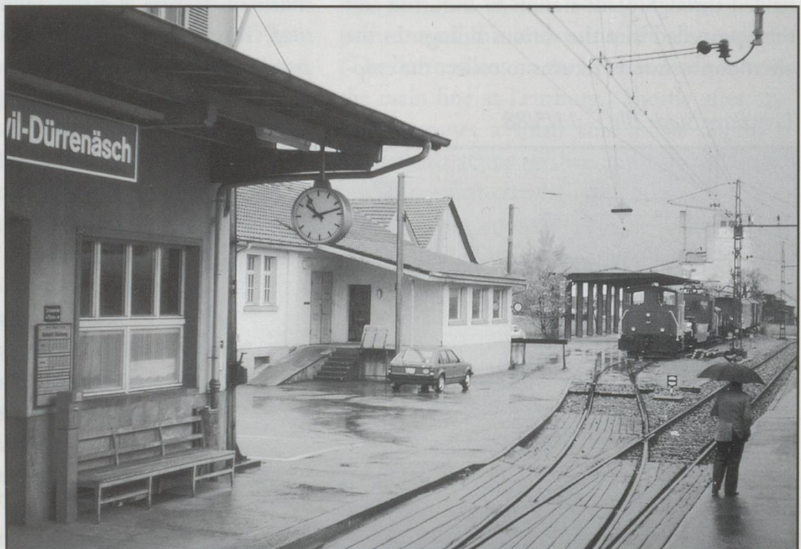
Hallwil-Dürrenäsch Bhf. 11/5/88

See an interesting telephoto view of the approaching train from Birrwil is possible. There are several sidings here and wagons are often left from the Beromünster branch or are tripped from nearby stations to avoid prolonged shunting. A PW tractor is often parked here. I have covered Beinwil in the Beromünster article and the remainder of the route to Emmenbrücke will be described in another issue.