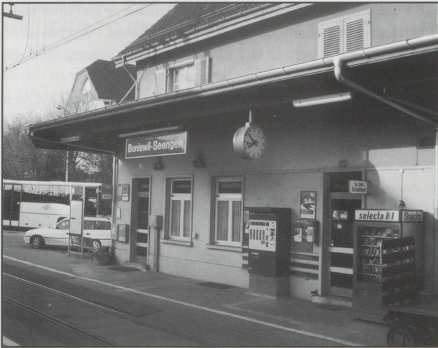
Boniswil-Seengen Bhf. - 4/99

until the main road comes in from the left and the railway runs alongside it until shortly before Seon. The road moves away to the left leaving room for the Seon station building and attached Goods Shed which is now used as a Kiosk. The track layout here consists of two loops and a siding and I have only once seen a goods van in the goods loop. Leaving Seon the route on its own right of way crosses a minor road before curving back through the houses and resuming its position on the western verge of the main road.