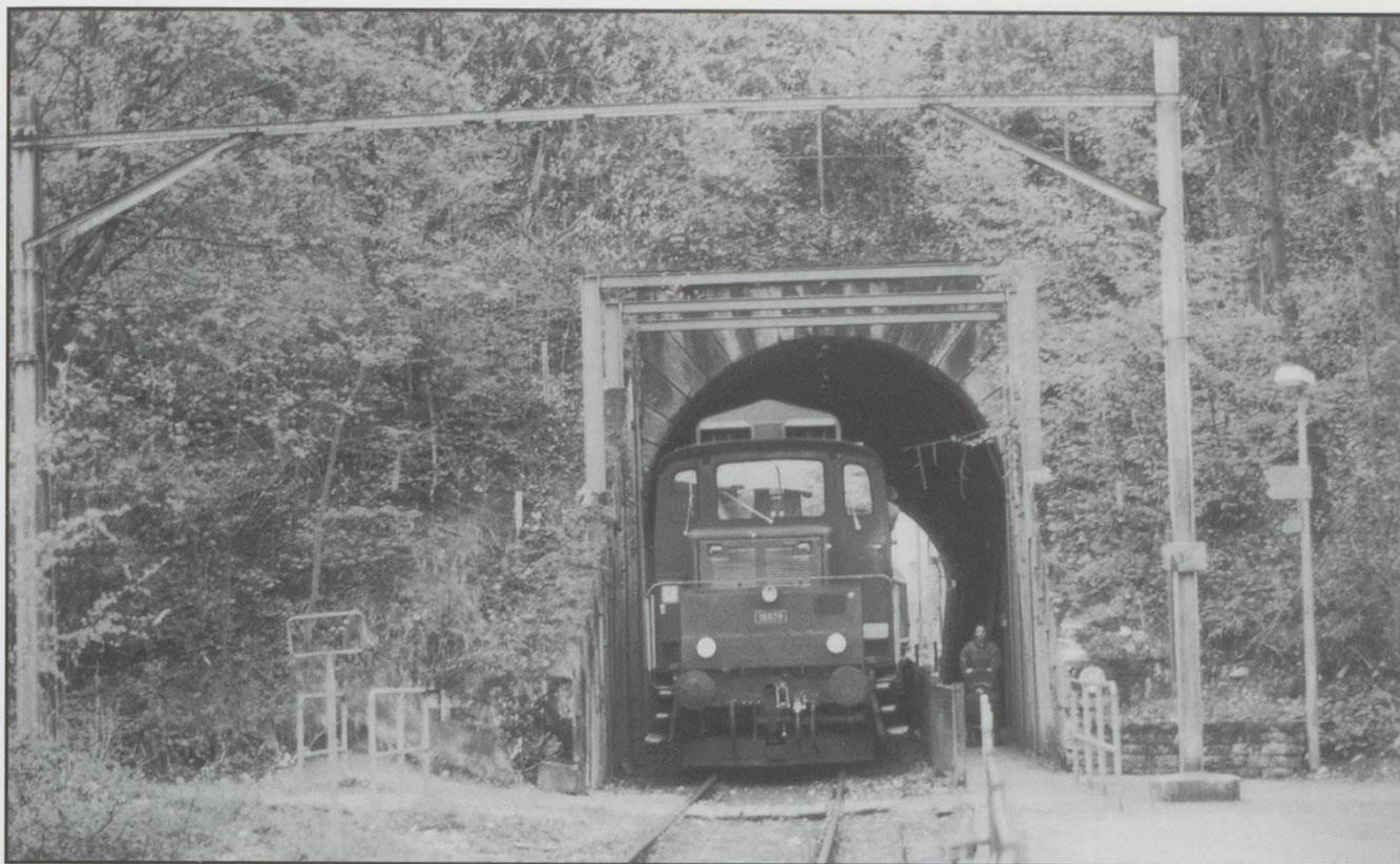
Tunnel under the main line at Lenzburg - 4/2000.