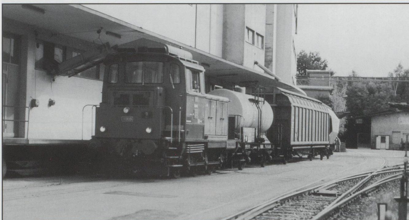
Lenzburg Industrie. The mainline is on the embankment behind - 4/98.

this first quarter mile as although the track is still down there are no parallel footpaths and the line follows the perimeter of a large active gravel pit. It is easier to take the road to Lenzburg, which leads away from the Wildegg Station building. Go straight over the main road at the crossroads and look out for a footpath on the right-hand side shortly before the road crosses the stream. About 300 yards along