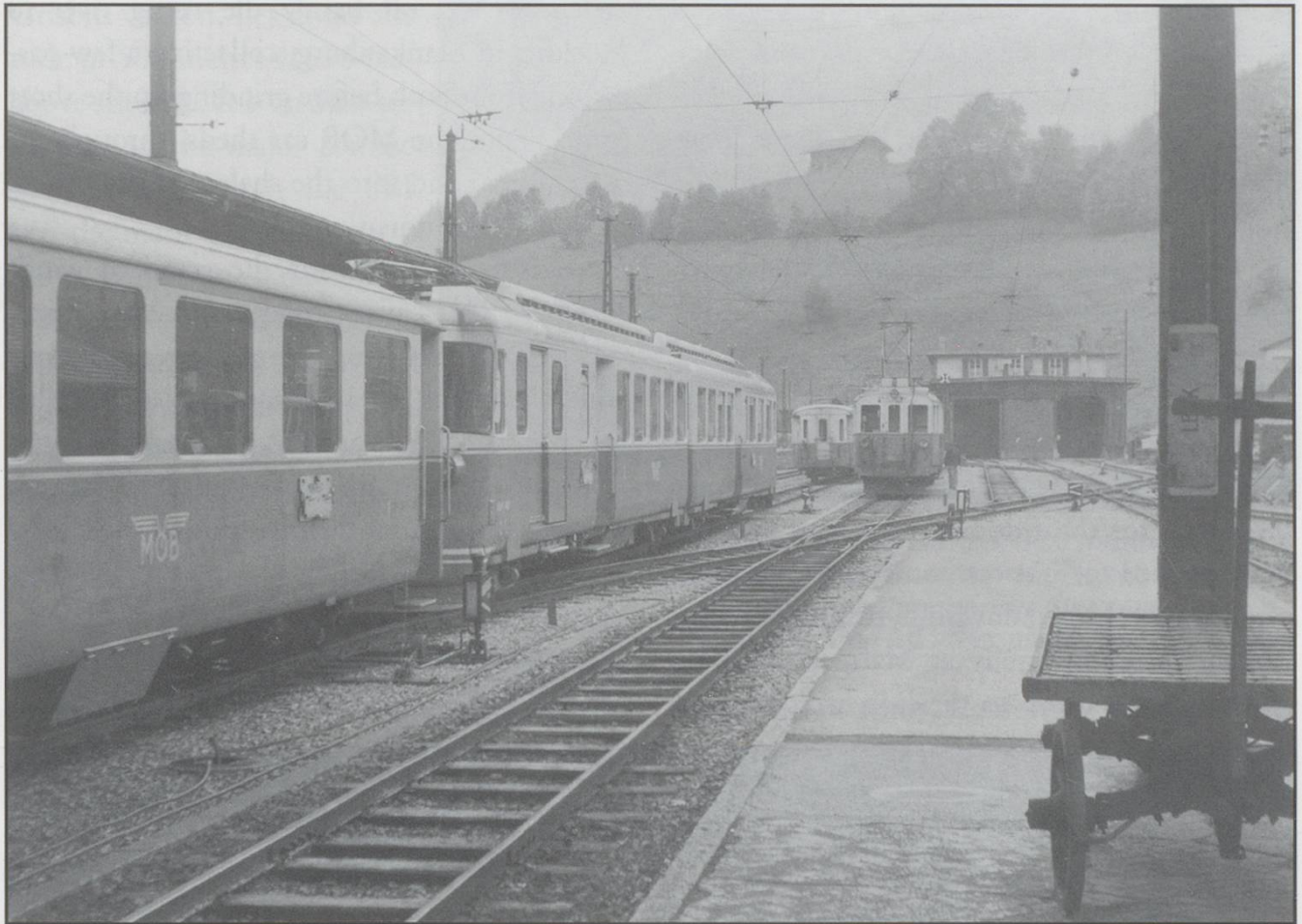
Zweisimmen station Sept. 1968. Montreux train on left headed by ABDe 8/8 with a type ABDe 4 4 railcar in the centre background.

called out in the midst of one of the heavier deluges of the day, changed the points and hastily retreated to cover, only to be recalled by the guard to collect a packet from the van. We were soon off again, for there was no other train on the branch, and climbed through Matten and Boden, both provided with halts, before finally grinding to a halt in the open plan terminus at Lenk.