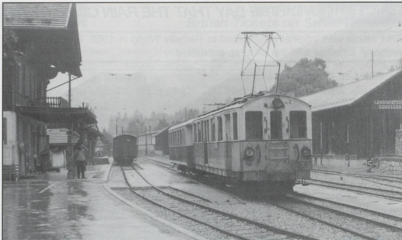
A general view of Lenk, Sept. 1968. ABDe 4/4 motor car awaits running round before returning to Zweisimmen.

worked as part of the BLS. The line curves around the base of the conical Niesen mountain, passing in turn an arsenal with its own branch line and the picturesque castle at Wimmis before plunging into the narrow mouth of the Simmental and climbing immediately up through the gorge and into the widening valley beyond. For the train it is an almost continuous climb with no advertised stop, although we are brought to a stand at Därstetten to wait for a downhill train to clear the single track ahead of us. We make a punctual arrival at Zweisimmen, 35 km from Spiez after a 36 minute journey.