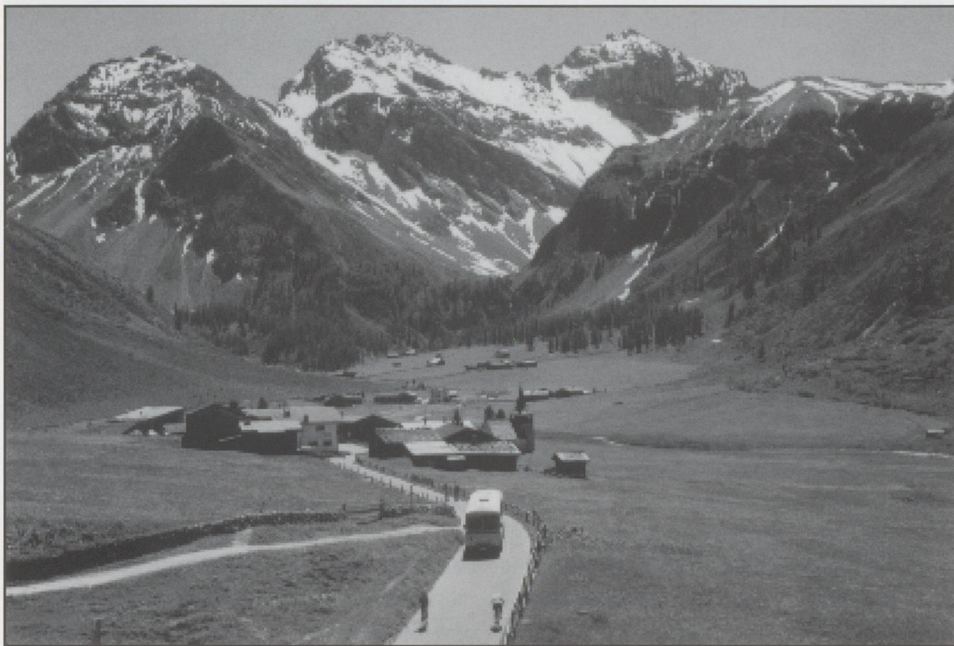
What can one say? The stunningly beautiful village of Sertig-Dörfli, the subject of a walking suggestion by Pete Dyson who took the picture on 1/7/1991.

Most of our self-catering holidays make full use of Utoring apartments which offer good facilities at cheap prices outside the main seasons. Our base here is the Guardaval situated above the Parsennbahn which passes in a tunnel beneath it. This is superb walking country and the following are recommended. By the way Utoring apartments are marketed through Interhomes in the UK (tel: 020 8891 1294, usual disclaimer).