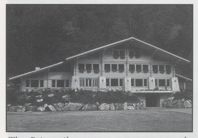
The Brienzwiler entrance restaurant at the Ballenberg Museum.

Switzerland's Open-Air Museum of Rural Living and Culture occupies an extensive area at Ballenberg+ near Brienz BE+. The museum opened in 1987 with a large collection of vernacular buildings re-erected there from various parts of Switzerland. Since then the collection has grown steadily. There are two entrances: the west entrance at Hoffstetten and the east entrance at Brienzwiler. Both are served by Postal bus from Brienz+ SBB. Walking between the two entrances by a fairly short route would probably take less than an hour