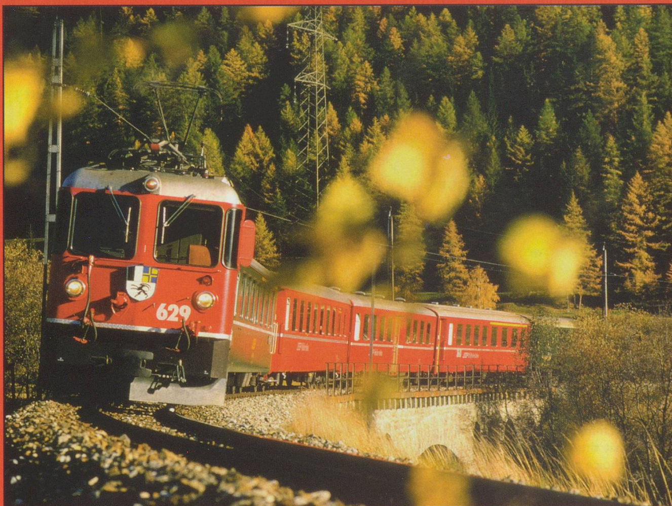
BELOW: A lovely autumn scene with Ge4/4 II 629 heading.