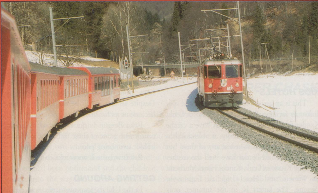
ABOVE: Geoff Turner took this picture of the new loop on the RhB's Prättigau line at Fuchsenwinkel in January 2000 shortly after it was commissioned.