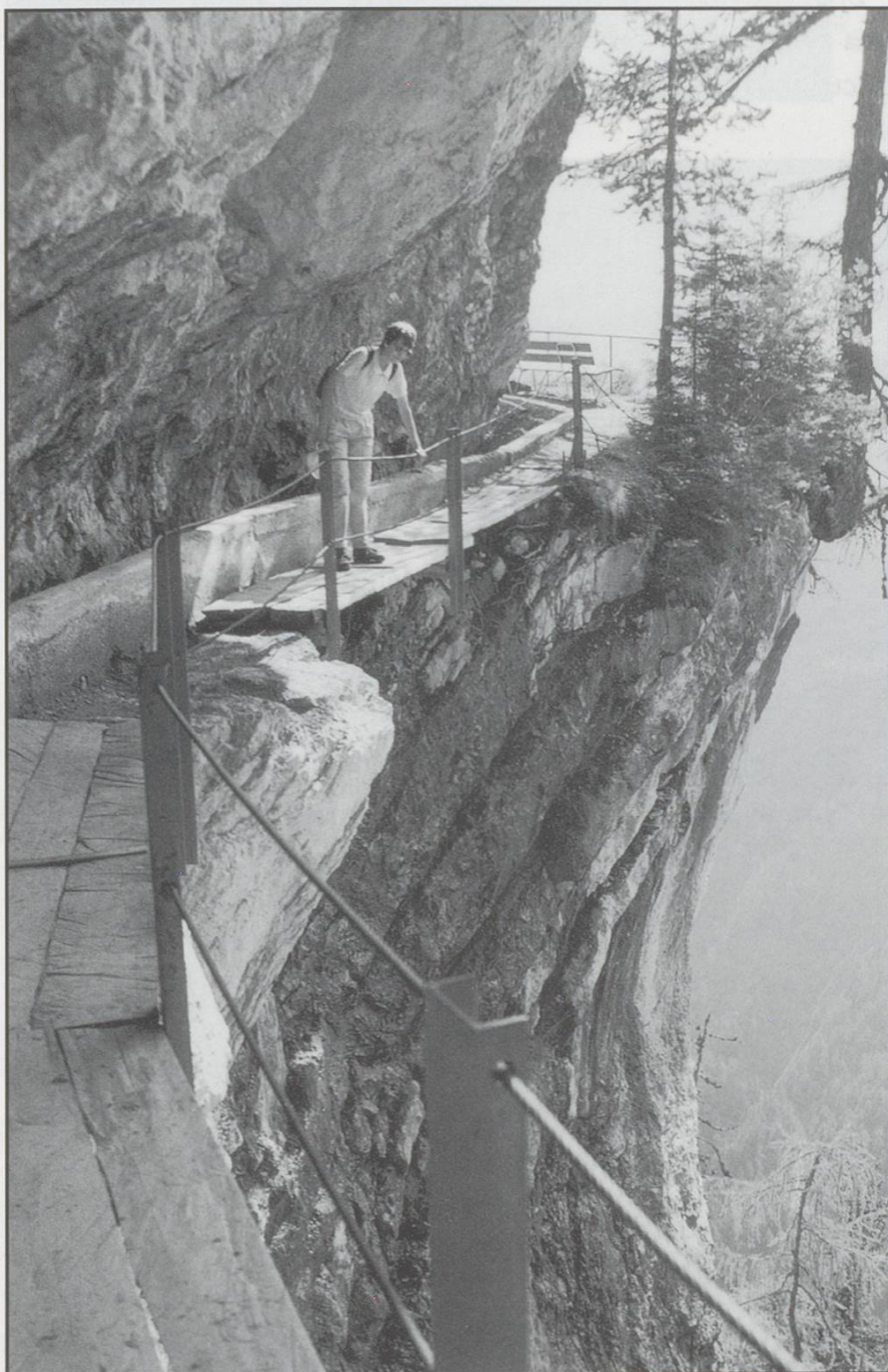
Looking over, literally, the Bisse du Ro.