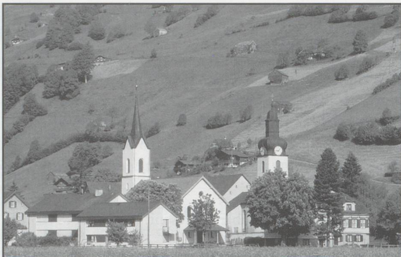
Alt St. Johann.