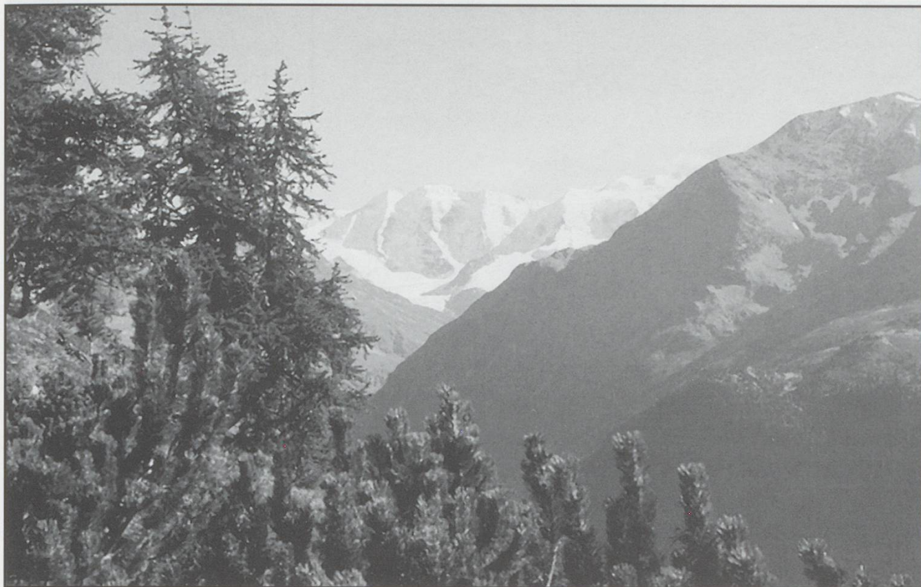
Piz Palu from Alp Languard.