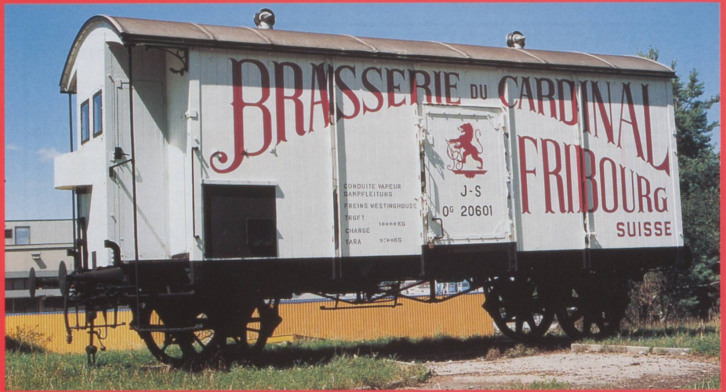
The beer wagon referred to on pages 18/19.