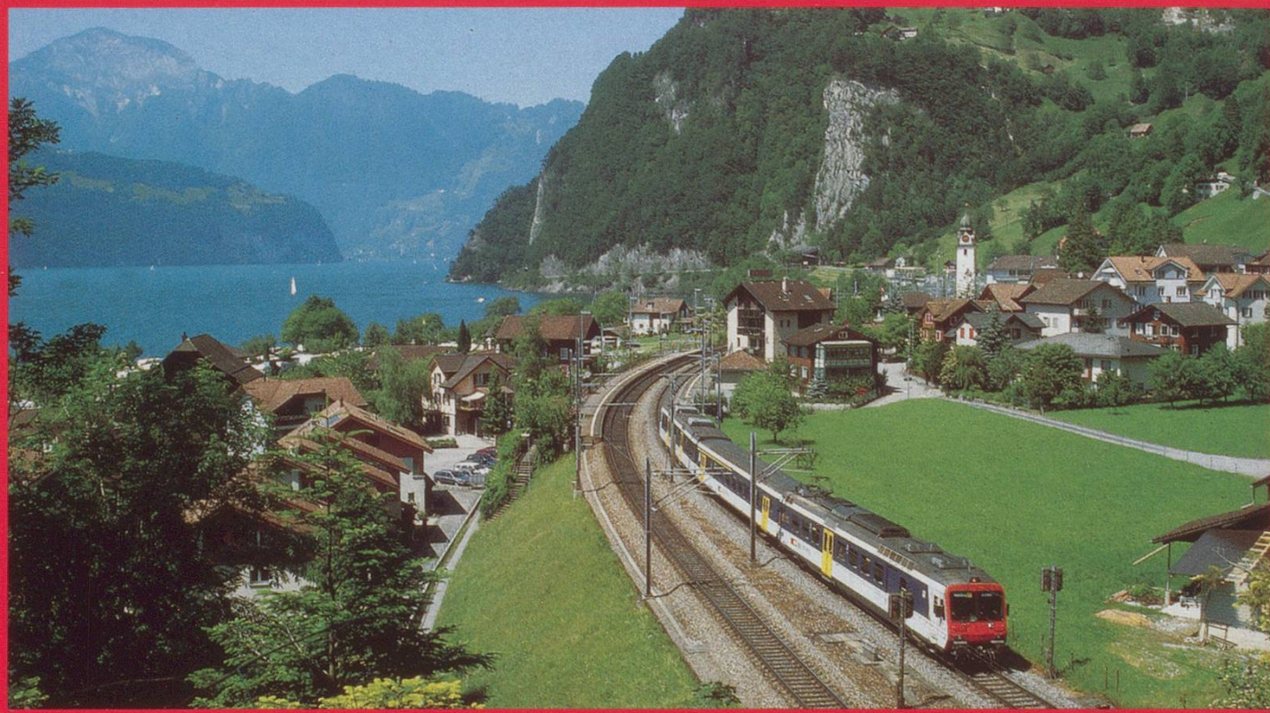
Sisikon 30/05/02 - RBDe 560 039 is seen departing Sisikon with the 1407 Zug-Erstfeld Regionalzug

hour at this point alone and managed some rewarding shots.