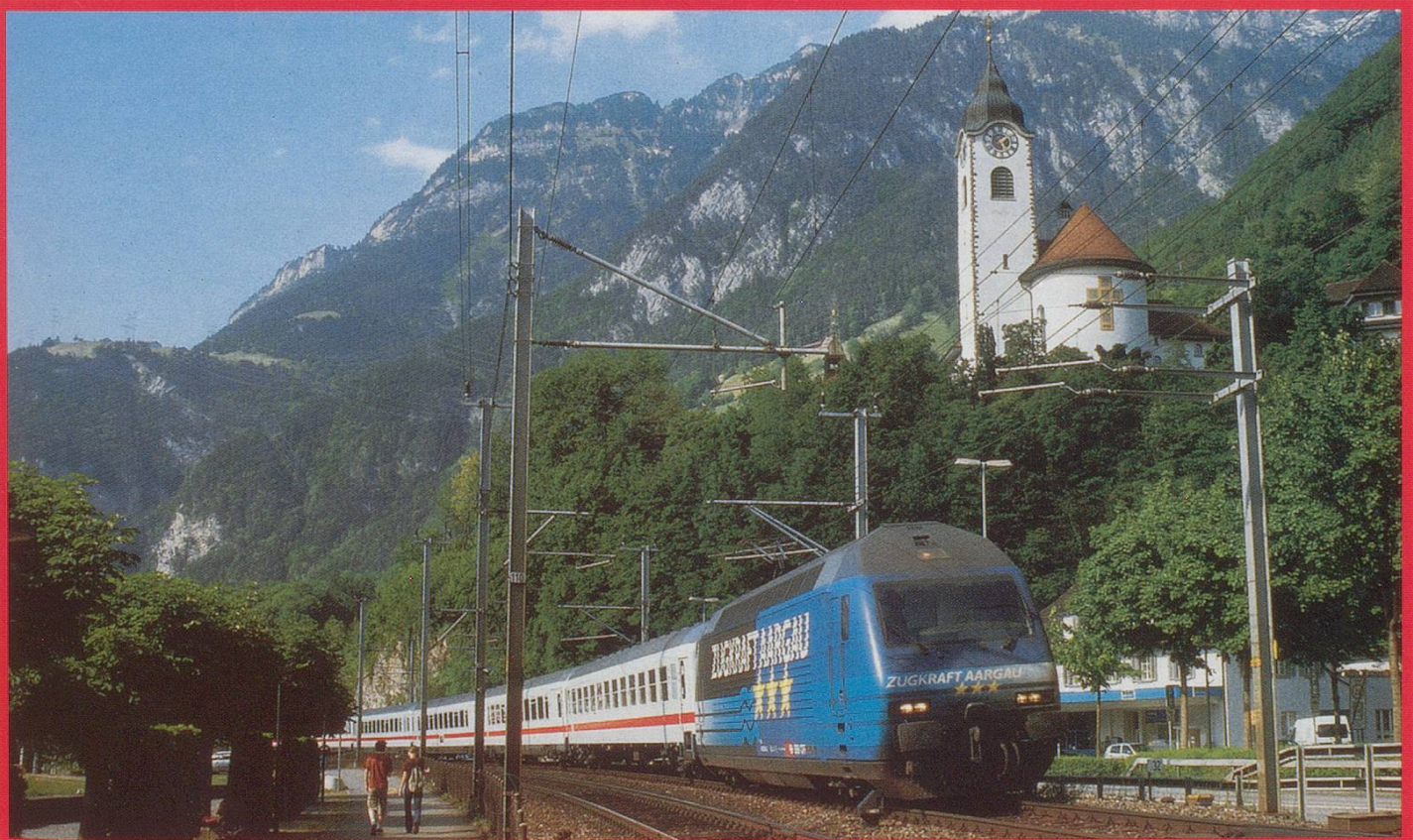
Flüelen 30/05/02 - Next stop Bellinzona - 460 034 in Zugkraft Aargau advertising livery heads the S/B EC Tiziano (Hamburg-Milano) on time at 1709. This was its second S/B run that day having worked the 0830 IC from Zürich and returned north to Luzern with the EC Verdi

Unfortunately, my walk down to Gruonbach, where the railway exits the last tunnel before Flüelen, was thwarted on this occasion by road works. Just short of a vantage point, which offers a superb view of the north-bound line (well it did in 1970!), my way was barred by barriers and a diversion onto the