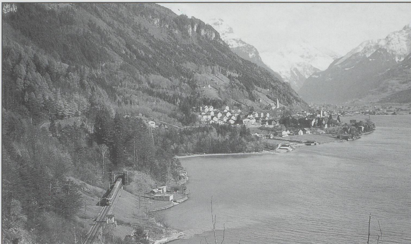
Near Gruonbach, Flüelen in May 1970 - An Ae6/6 heading a N/B passenger from the point where road works prevented access in May 2002.

“Swiss Path” was necessary. The main road was not accessed again until I reached the northern portals of Gruonbach tunnel. Unlike the relatively easy going so far this involved not only a fairly steep descent down many steps but also some fairly steep climbing and the going was certainly heavy for someone of my advancing years and unhealthy state of fitness (I fully concur with the wise decision of Peter Rose in SE6/11 to avoid the “vertical” climb from Rütli!). Still, I made it but was certainly glad of the break to take shots of southbound trains leaving Gruonbach tunnel. I missed the two southbound passenger trains just after 16.00 as this unplanned diversion put about another 15 minutes onto my journey. This latter viewpoint is reached by taking a right hand turn off the main road on the outskirts of Flüelen onto a narrow road that immediately crosses the southern portals of Gruonbach tunnel which itself is only 98m in length. The road then runs adjacent to the railway leading to Flüelen SGV landing stage and SBB station. Just before those