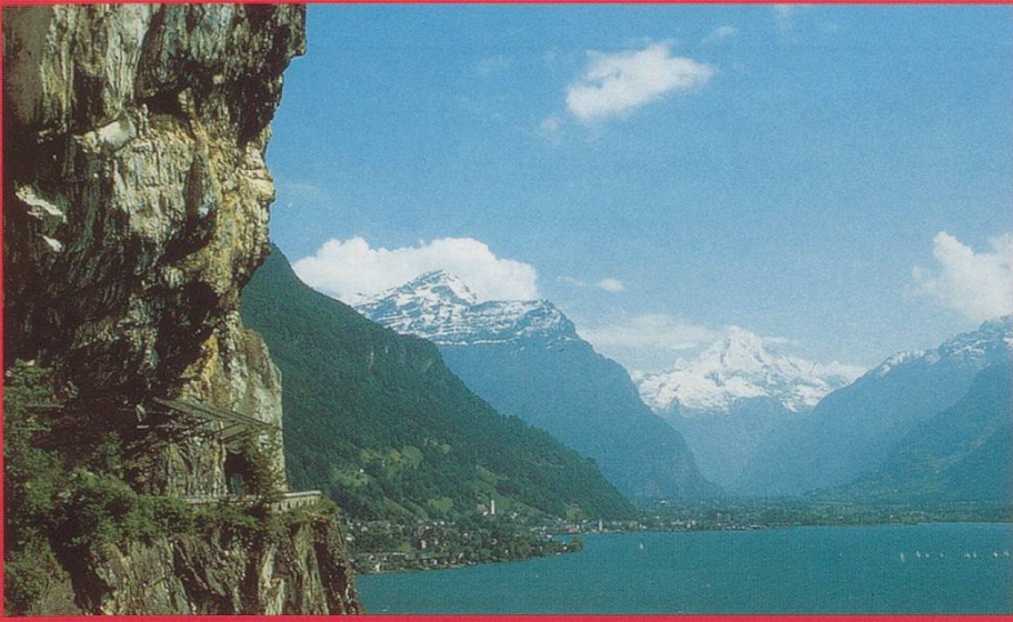
30/05/02 - The view South from the Axenstrasse galleries near Adams Rüti. Flüelen is in the distance where the wide valley narrows. The Bristenstock (3072m) dominates the centre background.

for my next port of call, the galleries just beyond Tellsplatte that overlook Flüelen and the southern end of the lake. This is near to a point known as Adams Rüti! (Do I have a distant ancestor in these parts?)