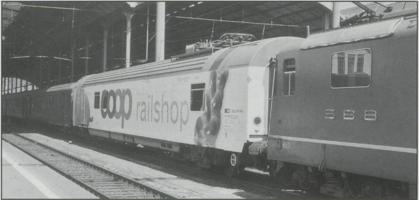
The new Coop-Railshop in Olten.

One of the newest attractions on Swiss railways is the mobile shop on the Bern-Zürich line. It is operated by the Coop, one of the biggest supermarket chains in Switzerland. The two ex-McDonald's restaurant cars, out of use since May 1999 were completely gutted inside and refitted as self-service stores.