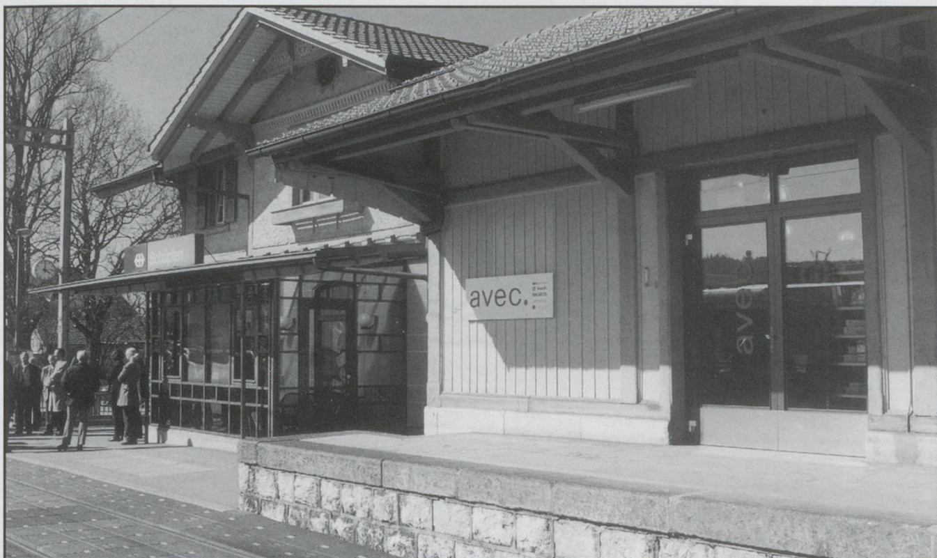
A very clean and welcoming station in the small rural village of Schüpfen on the line from Bern to Biel.

Times change. Today we have a lot of people travelling on season tickets and passes. Information and bookings are available over the phone and on the Internet. The “Easy Ride” project will allow passengers to travel with a chip-card: scanners note your travel and you get a monthly bill. All this means that fewer people will go to the ticket office at their local station. This commercial pressure - Mrs Thatcher used to call it “economic reality” - makes it hard to keep small stations staffed. Even a yearly sales volume of four hundred thousand Francs (that is eleven hundred francs every day of the year!), puts a station in the danger zone. But we all know what happens to a closed station: first the graffiti sprayers take over, then the vandals. The site, which should be a welcoming focal point for the railway then becomes a total disgrace and an incentive to buy a car. Contrary to the Blue Lady, the SBB decided something had to be done. A work group was set up in the Winter of 1997 to find additional as well as alternative uses. Just over a year later, in the spring of 1999, three pilot schemes were