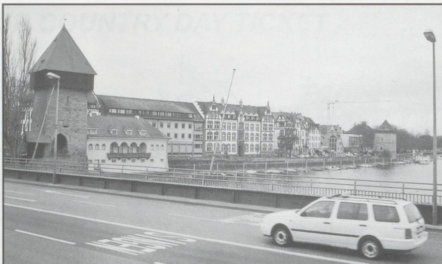
From Friedrichshafen, I took a German train along the northern shores of the Rhine, to Radolfzell. From there, a MittelThurgau Bahn electric railcar, running a border crossing service from Engen, Germany to Weinfelden in Switzerland. Here we cross the Rhine at the pretty town of Konstanz. Not a border crossing: both shores are inside Germany.

this site, about a frog (the logo and mascot of the new ticket) catching insects with his tongue, earning points. Aimed at kids, who can win free day cards and then will pester their parents to ride. Great fun, although a stork caught my frog, before I could clock up a reasonable score . . .