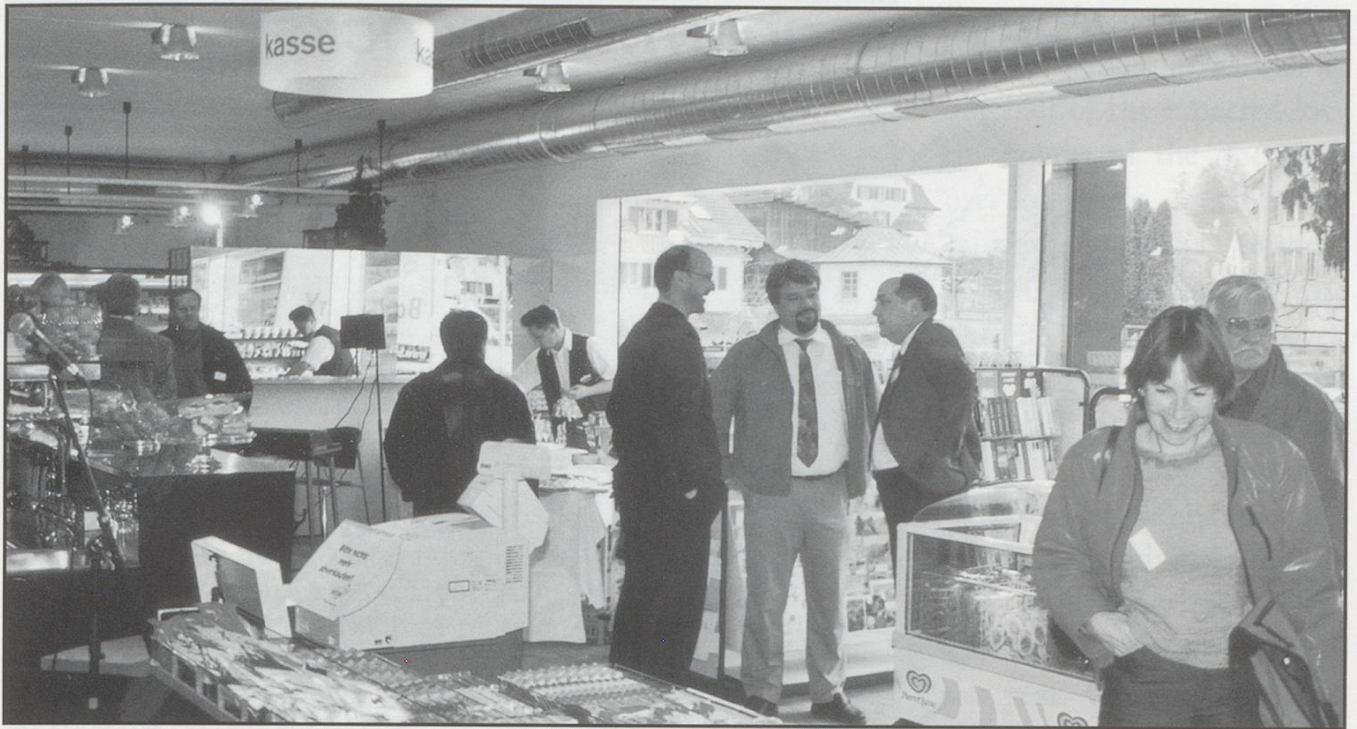
ABOVE: Inside, the large windows towards the road let in lots of light. As this station (the SBB one) is about a mile from the town, the avec store is not really in competition with other suppliers.