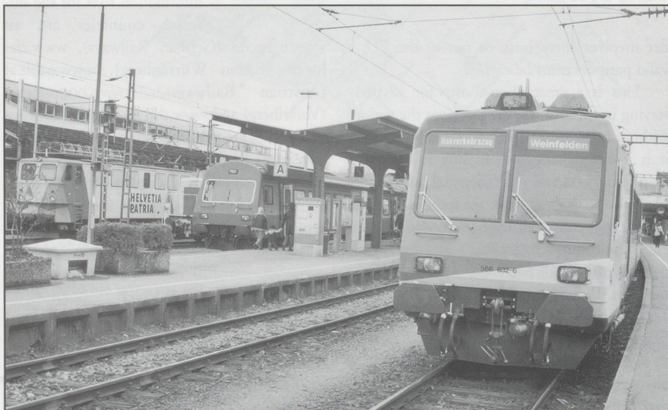
This is Konstanz railway station in Germany, but apart from the barely visible class 365 German diesel shunter, all the stock is Swiss! The Ae 477 (ex DR) in "Helvetia Patria" livery (an insurance company), belongs to the MittelThurgau-daughter Lokoop; the driving trailer is from an "Swiss Express" set (SEE, mark III stock, not us!), running a "RX" (Regional Express) service to Zürich airport, sometimes extended to Bern-Geneva Airport, known as "City Vogel" and finally a MThB class 566 electric railcar. Truly Euregio!