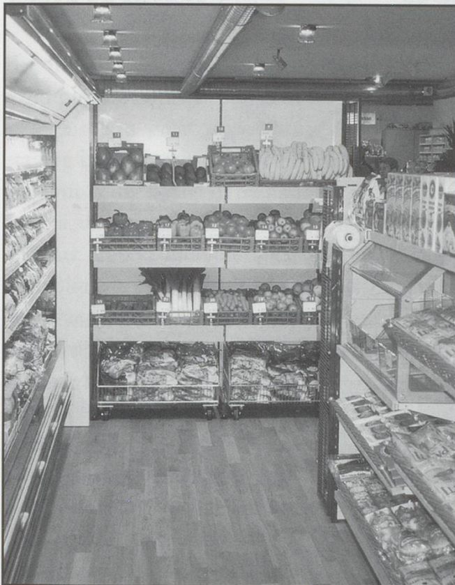
LEFT: As in other avec stores, the range is based on that of Migros, one of its partners. Prices are also the same as in the supermarkets. Fresh produce is also on sale.