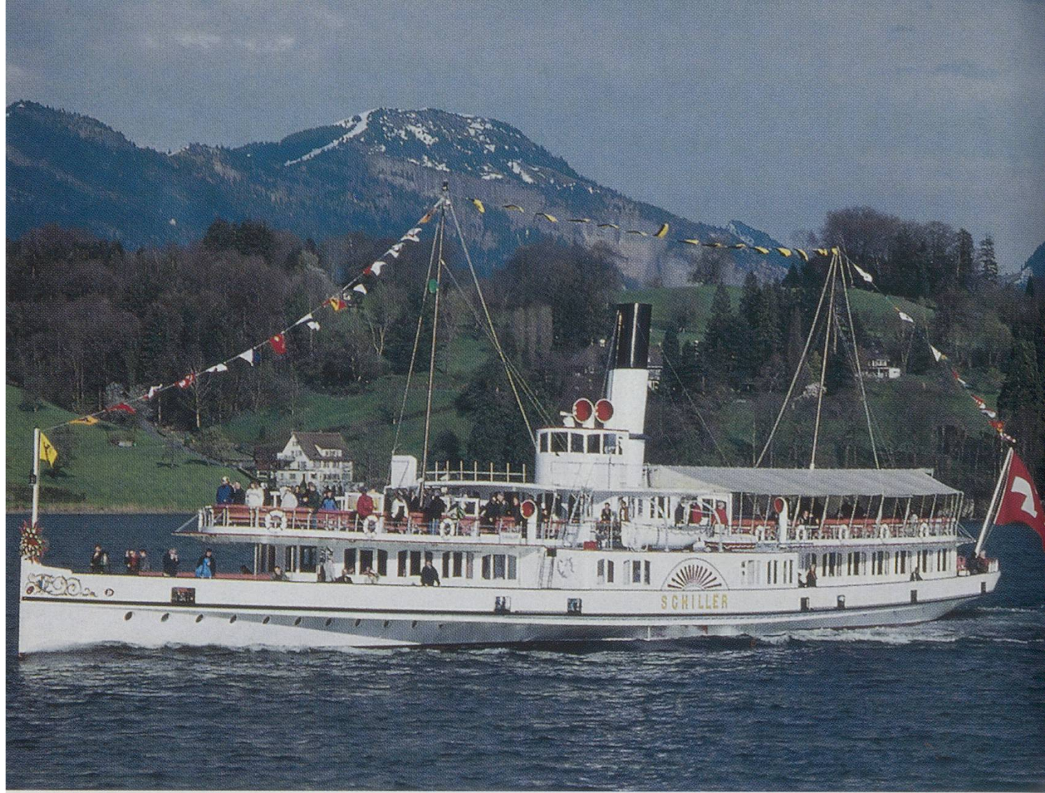
Above: DS Schiller turns into the homeward leg of the journey as she passes near Meggen. April 2000.