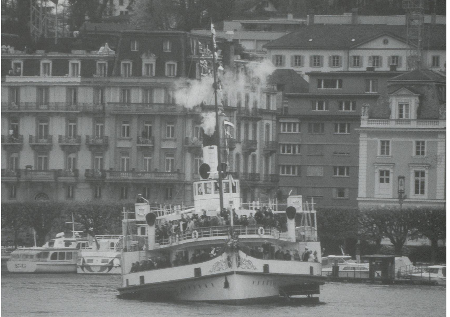
A heavy list to starboard as guests flock to catch a glimpse of "Schiller". 15th April 2000