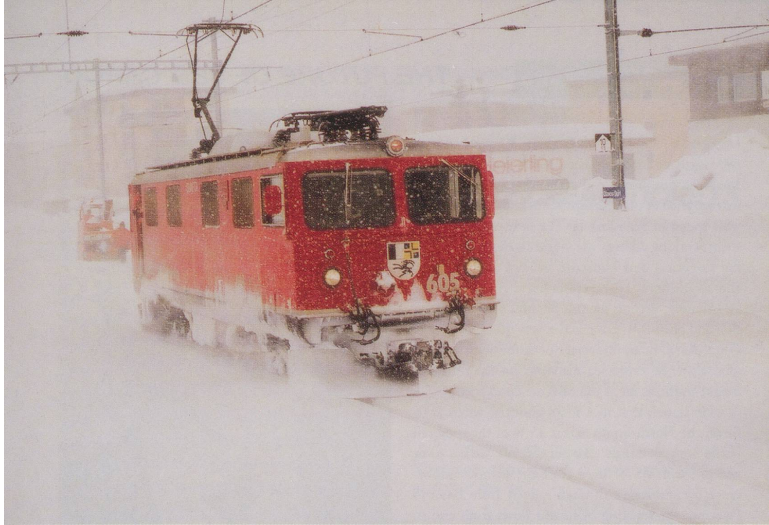
Above: RhB Ge 4/4 waits in the snow at Davos whilst a mad englishman takes it's picture. February 2000.