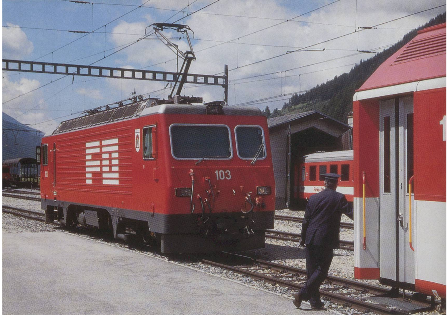
Above: The worlds most powerful rack locomotive (see Tooth by Tooth) FO HGe 4/4 1 103 backs down on to a Glacier Express having dropped off an RhB Restaurant car. Below: Prior to the extension to Brig VZ HGe 4/4 no.16 is pictured at Zermatt in the summer of 1963. A delightful reminder of the past.