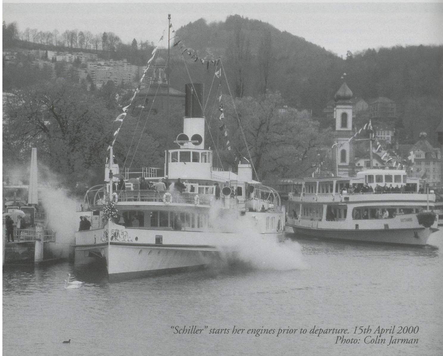
"Schiller" starts her engines prior to departure. 15th April 2000

The briefing was in high German, but with English subtitles kindly provided from time to time for us and for the reporter from Ships Monthly magazine. We were told how the finance was raised for the ChFr 6 million rebuild of the Schiller, which was launched in 1908. Individuals and organisations had sup-