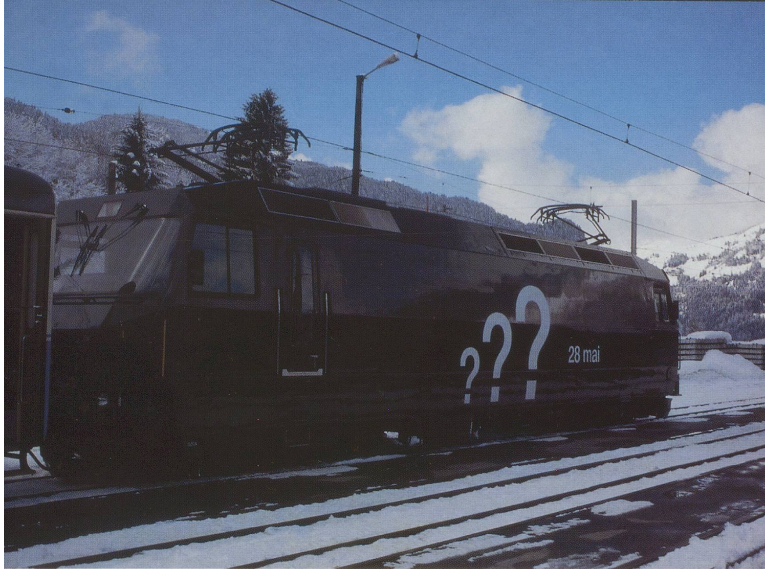
Above: The MOB's mystery Ge4/4 8003 at Gstaad, 1/3/00. See Notepad.