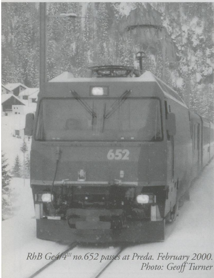
RhB Ge4/4 III no.652 passes at Preda. February 2000.