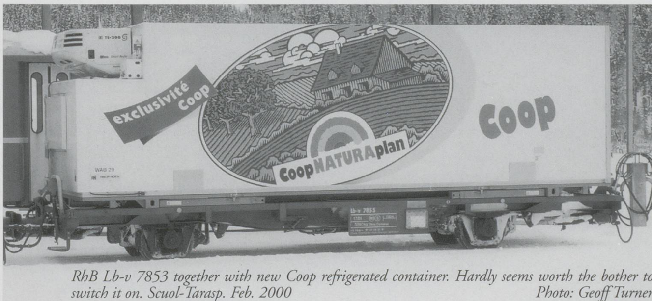
RhB Lb-v 7853 together with new Coop refrigerated container. Hardly seems worth the bother to switch it on. Scuol-Tarasp. Feb. 2000

If you have enjoyed the description of my experiences then please go to Klosters in the winter and enjoy. It may be the most exciting experience you ever have.