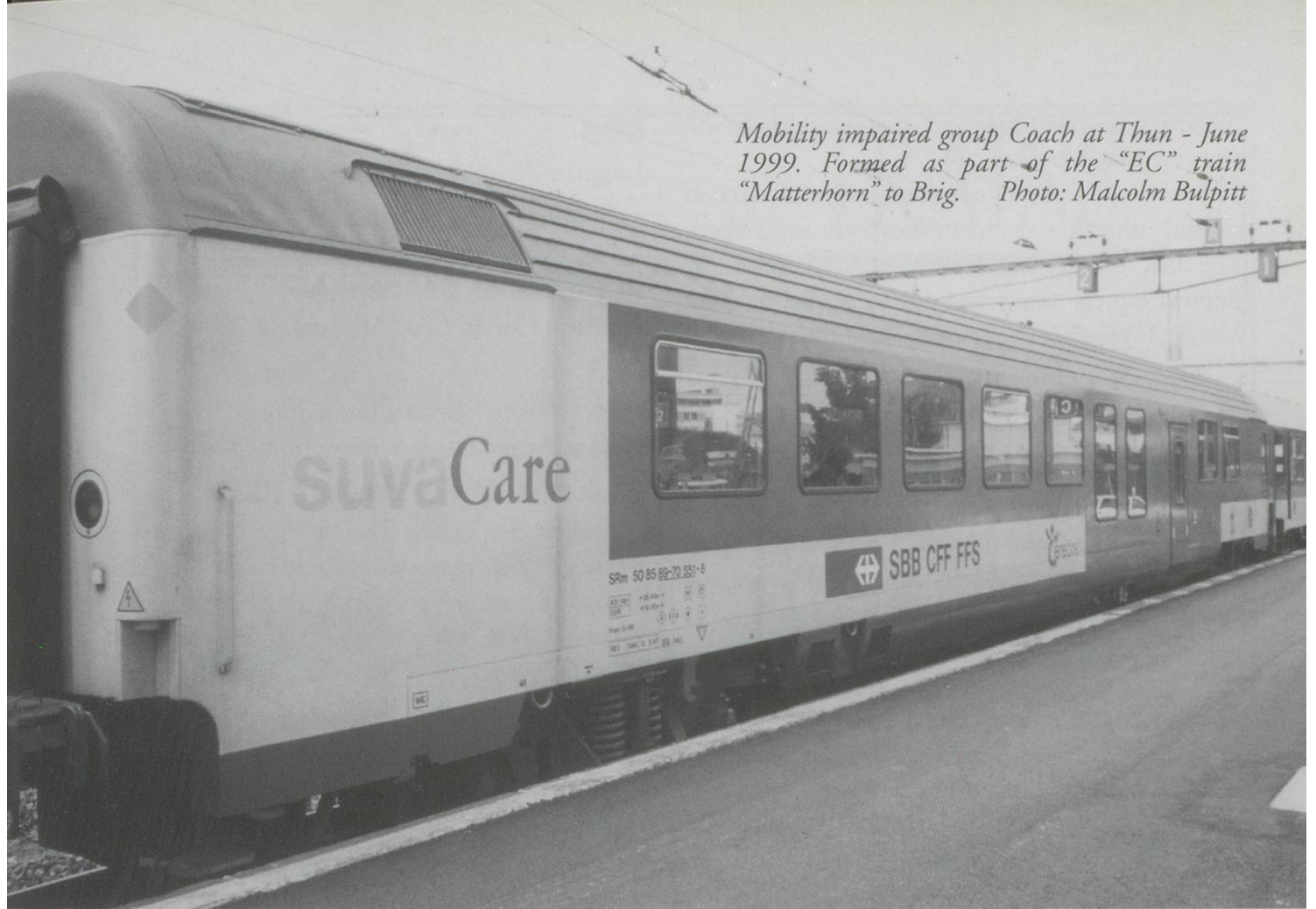
Mobility impaired group Coach at Thun - June 1999. Formed as part of the "EC" train "Matterhorn" to Brig.

The following infrastructure changes to the VAE route are planned: