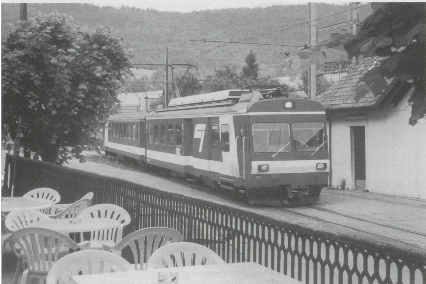
Chemins de Fer du Jura BDe 4/4 1 613 arrives at Glovelier 8/2000. Looks like an excellent place to wait for trains. You don't even have to leave your seat or glass.