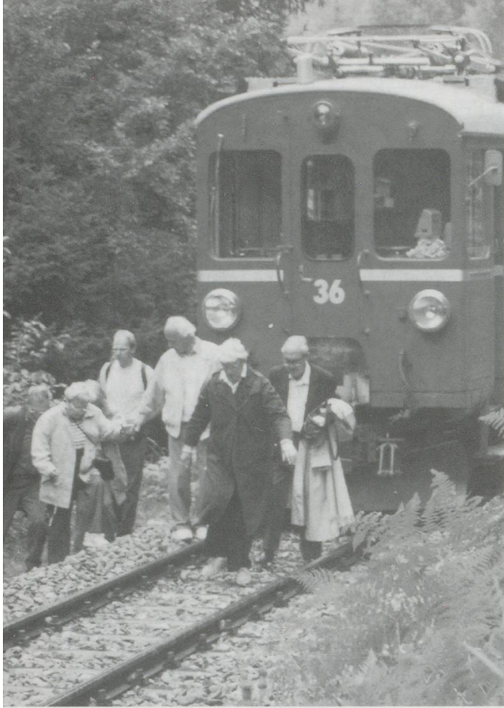
Passengers make a precarious walk along the track towards "relief".

Our walk now took on the form of a quick hike up the road to Preda. Hardly any traffic was moving, nothing passing us on our walk to Naz and on to Preda. The snow here was very thick, and walking