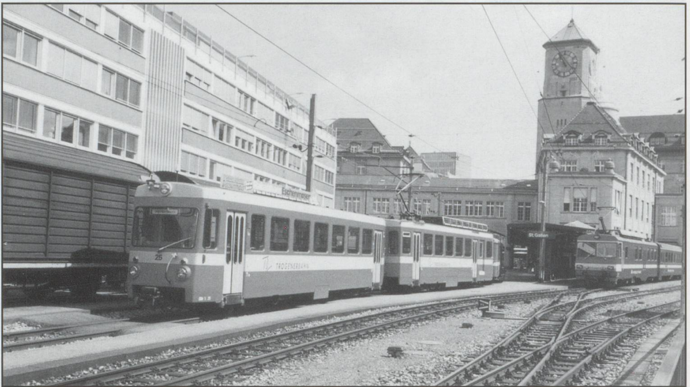
The joint Bahnhofplatz terminus of the Trogenrbahn and Appenzeller Bahnen in St. Gallen, 05/98.