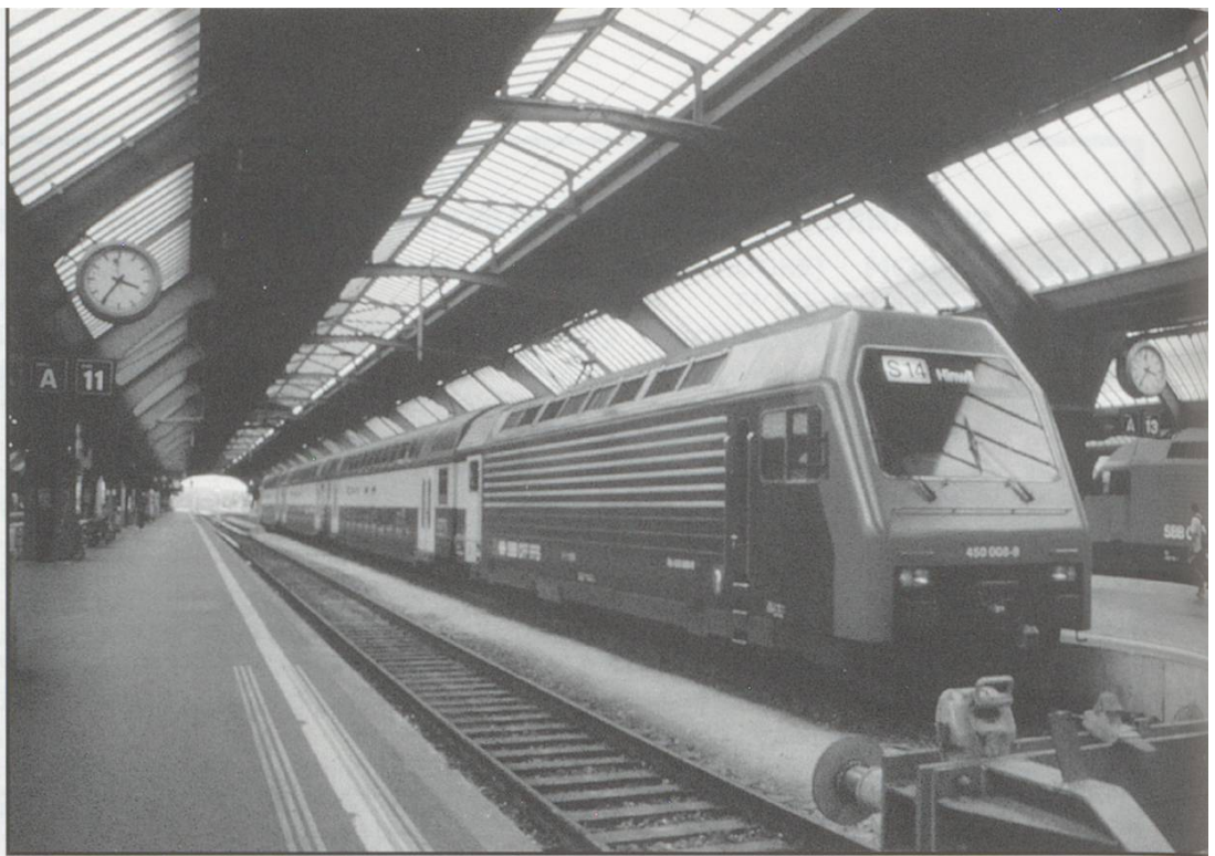
Zürich HB, 28.07.98. 450008 working an S14 service to Hinwil

S1 to Zug via Thalwil. Both lines S1 & S2 only run hourly. Lines S4 (every 20 minutes, Re 456 push & pull double deck stock) & S10 are operated by SZU and use sub-surface platforms 1 & 2. Lines S1, S4, S10 & S14 are the only S-Bahn lines that start and terminate at Zürich HB/Sihlpost.