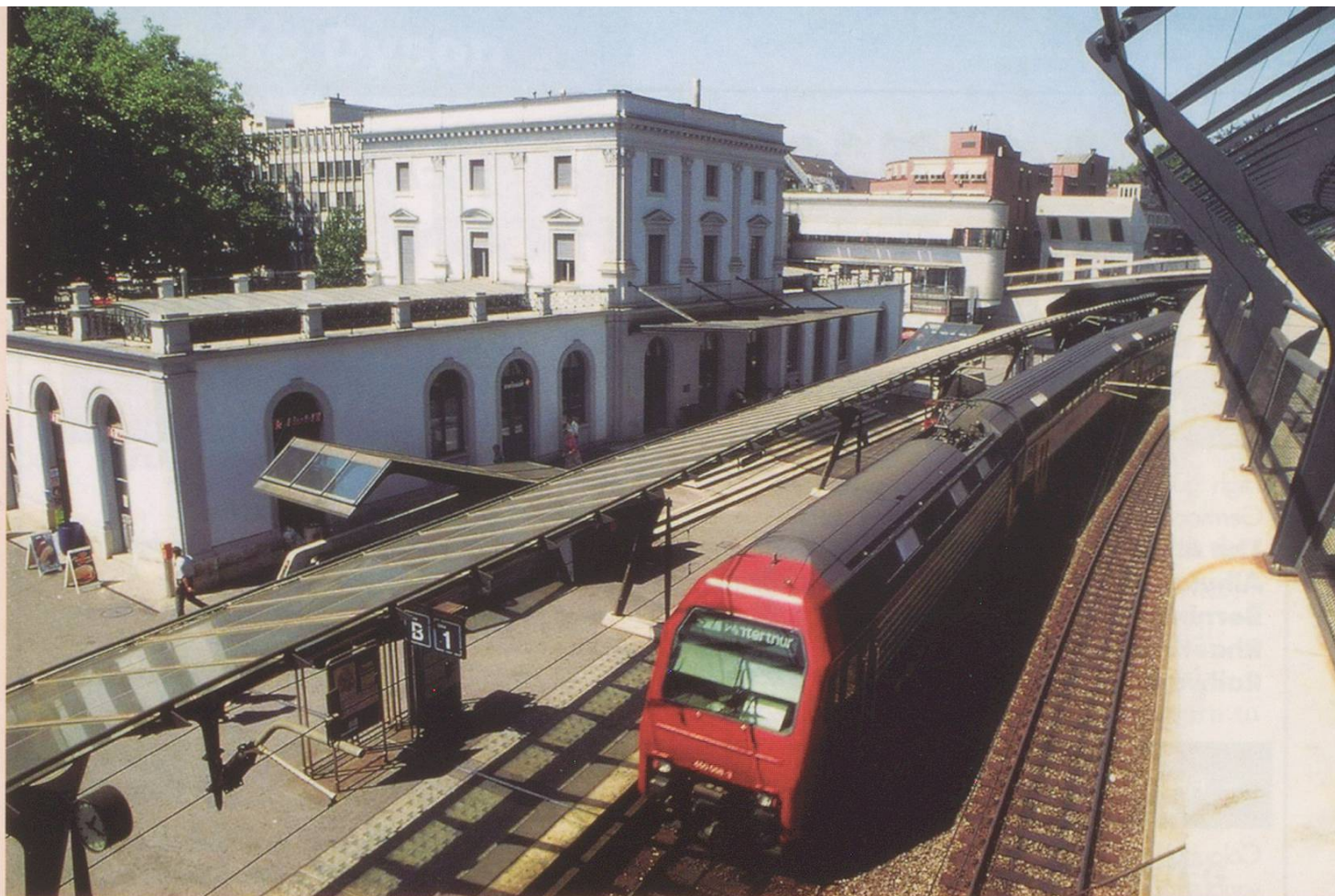
Another view of the old and modern mix at Zürich Stadelhofen.

ally operated by pairs of SZU Be4/4's every 30 minutes from platform 2. There are views over Zürich, Zürichsee and the surrounding district from above the summit station to which the line climbs almost continuously from the inner suburbs gaining over 400m in height on the 21 minute journey (the journey down takes a minute longer!). There are also hiking paths along the ridge from the summit for those wanting to explore further.