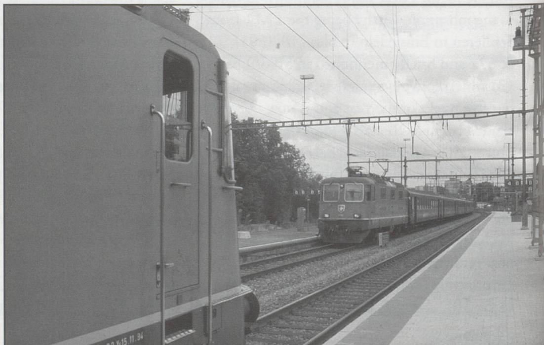
Dietikon 05.06.03. Re4/4 II 11219 awaits departure with Train S18065, the 1620 Dietikon-Rapperswil via Zürich HBLL and Wietikon.

Shortly after leaving Tiefenbrunnen the line enters the sub-surface section through Zürich and we suffered a short signal stop before Stadelhofen. Departure from Zürich HB was only 1 minute in arrears at 18.09. We emerged from the sub-surface tunnel running parallel to the rear of an ICN unit working the 18.07 departure to Geneva via Biel, a scene I