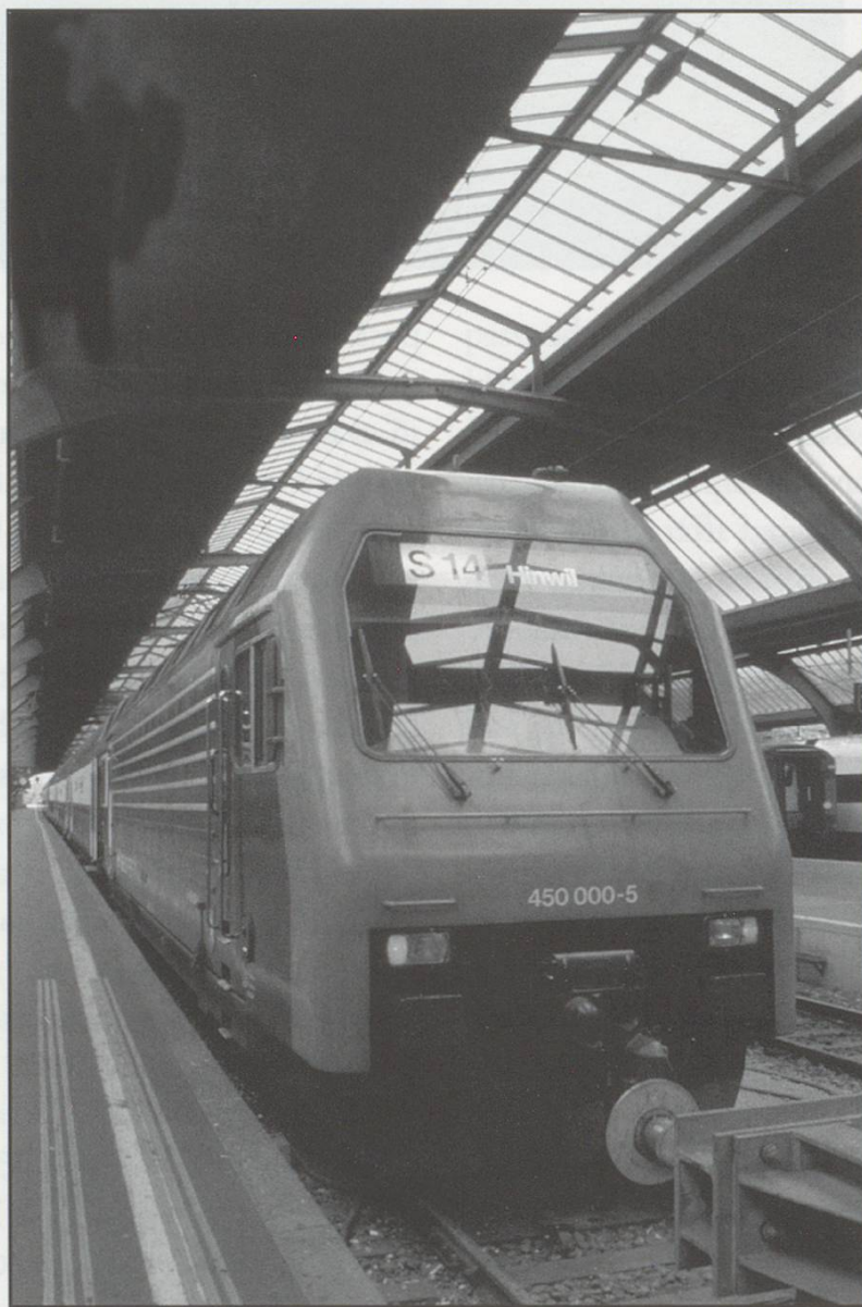
Zürich HB, 10.07.00. 450 class pioneer, 450000 stands ready to work an S14 service to Hinwil.

though the latter route is no doubt familiar to many who know it as the Zürich – Chur main line. Line S9 to Zug via Affoltern am Ablis also has some very pleasant rural aspects once the Zürich conurbation is left behind. Line S10 to Uetliberg uses DC overhead power and is usu-