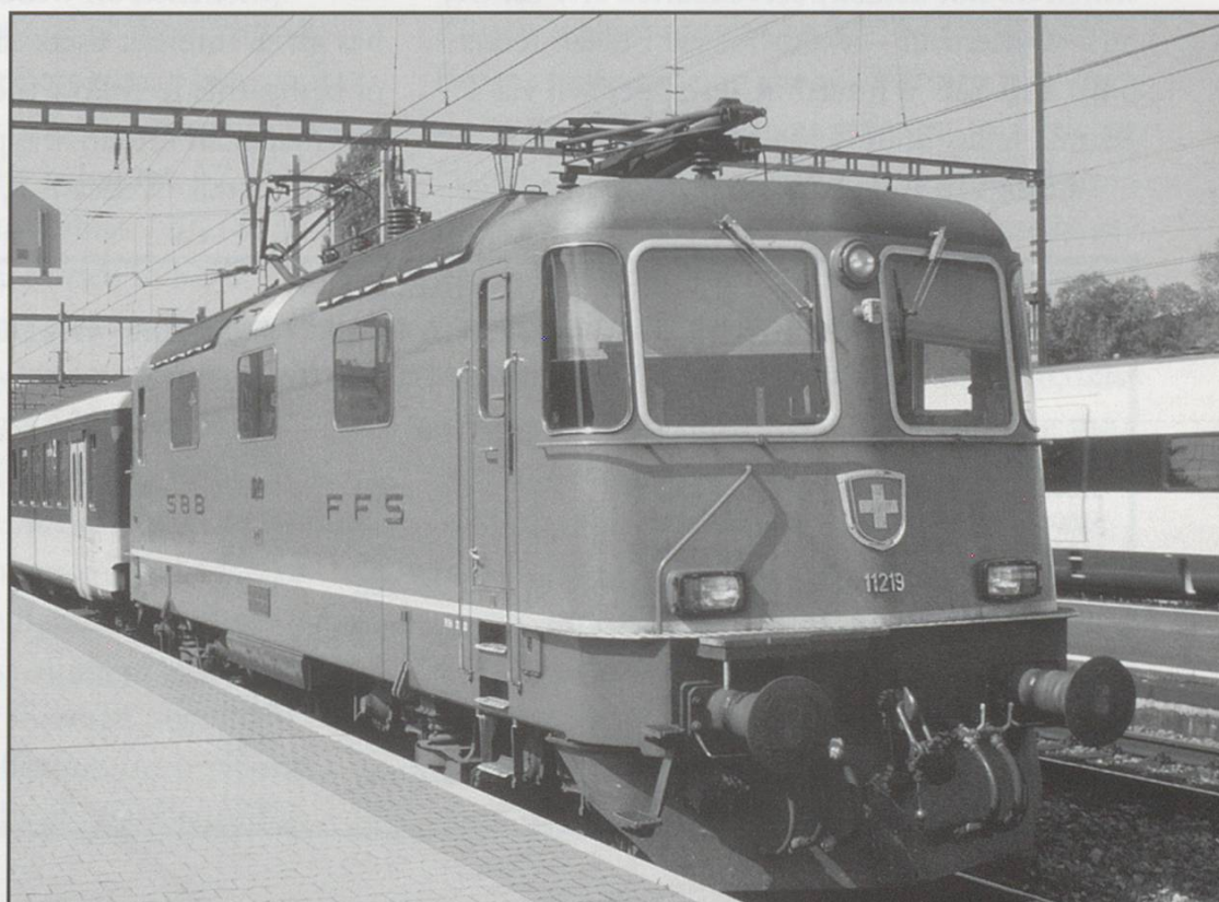
Dietikon 05.06.03. Re4/4 II 11219 awaits departure with Train S18065, the 1620 Dietikon-Rapperswil via Zürich HBLL and Wietikon.

At the present time line S3 runs between Wetzikon and Dietikon via Zürich HB sub-surface platforms running 15 minutes before and after line S12 trains to Brugg AG. In 2005 alternate trains on line S3 will be extended to serve stations between Killwangen-Spreitenbach and Lenzburg via the Heitersberg tunnel then Aarau including a new station at Mel-