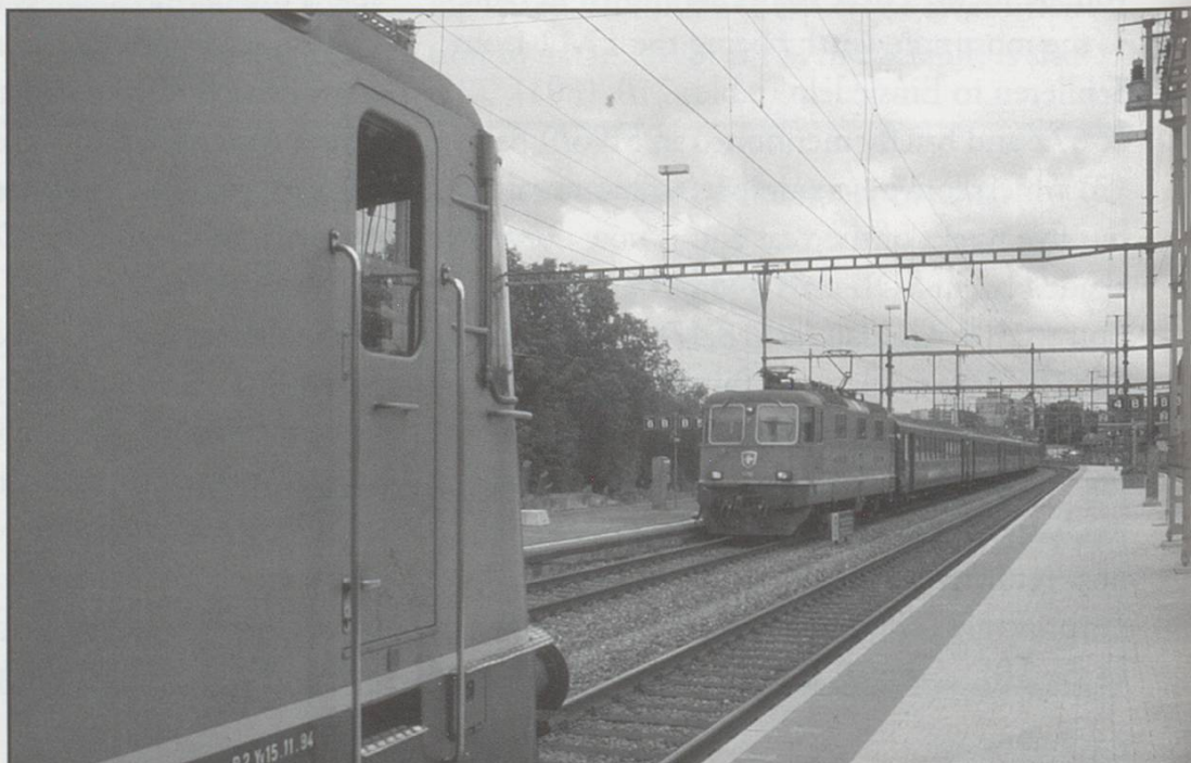
Dietikon 05.06.03. Re4/4 II 11219 awaits departure with Train S18065, the 1620 Dietikon-Rapperswil via Zürich HBLL and Wietikon.

Shortly after leaving Tiefenbrunnen the line enters the sub-surface section through Zürich and we suffered a short signal stop before Stadelhofen. Departure from Zürich HB was only 1 minute in arrears at 18.09. We emerged from the sub-surface tunnel running parallel to the rear of an ICN unit working the 18.07 departure to Geneva via Biel, a scene I