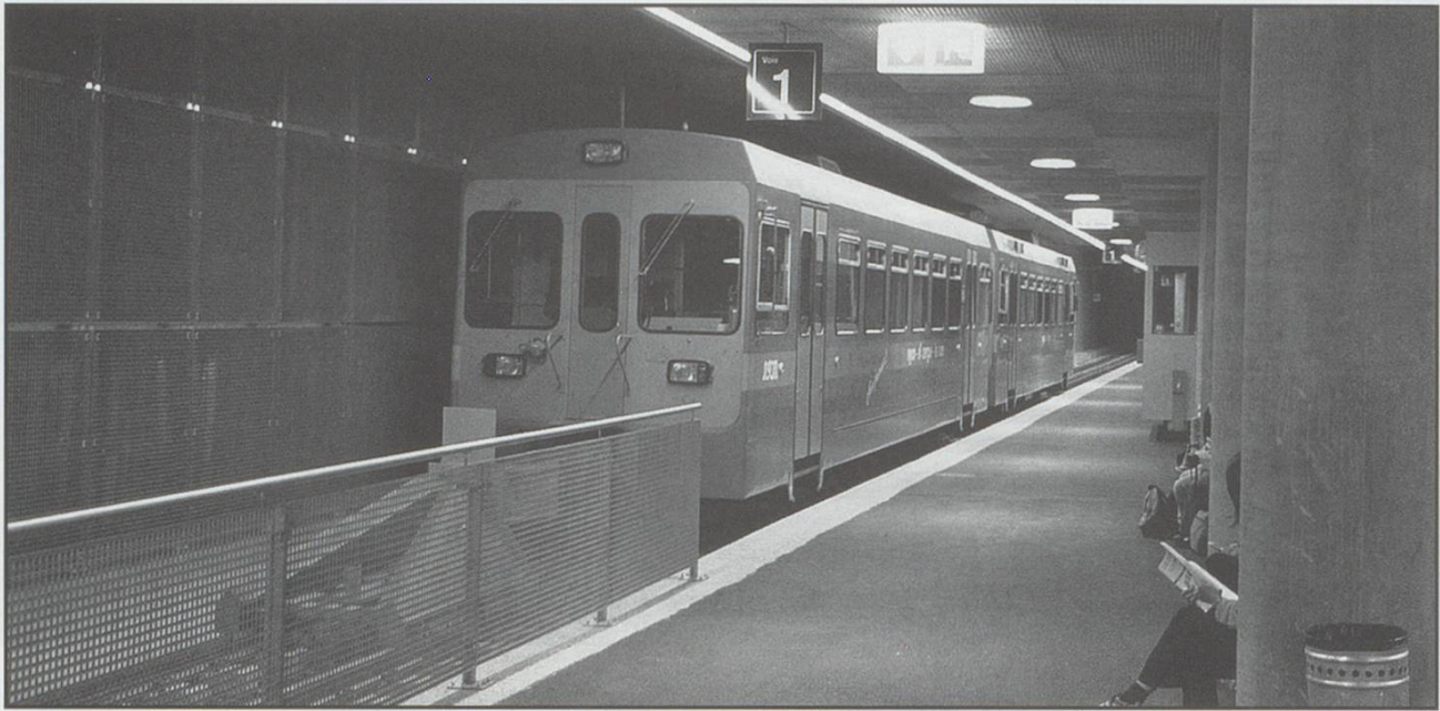
TOP: NStCM Bt 305 & Be4/4 302. New Nyon underground station. 2000hrs 01.10.04