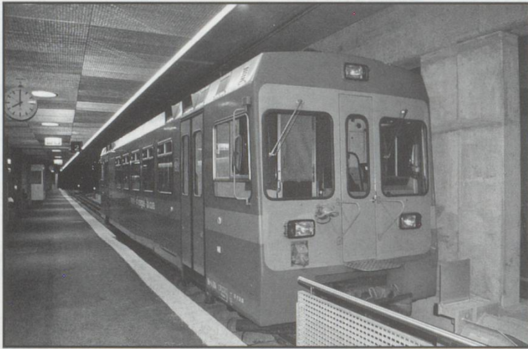
LOWER. NStCM Be4/4 204. A/A. Station still not quite finished, no seats etc. The connection to the SBB station is a bit primitive and you need all of the four minutes to get up, out and go across to get the Geneva connection!

RON SMITH SENT THESE PICTURES IN RECENTLY. SEE NOTEPAD FOR FURTHER DETAILS.