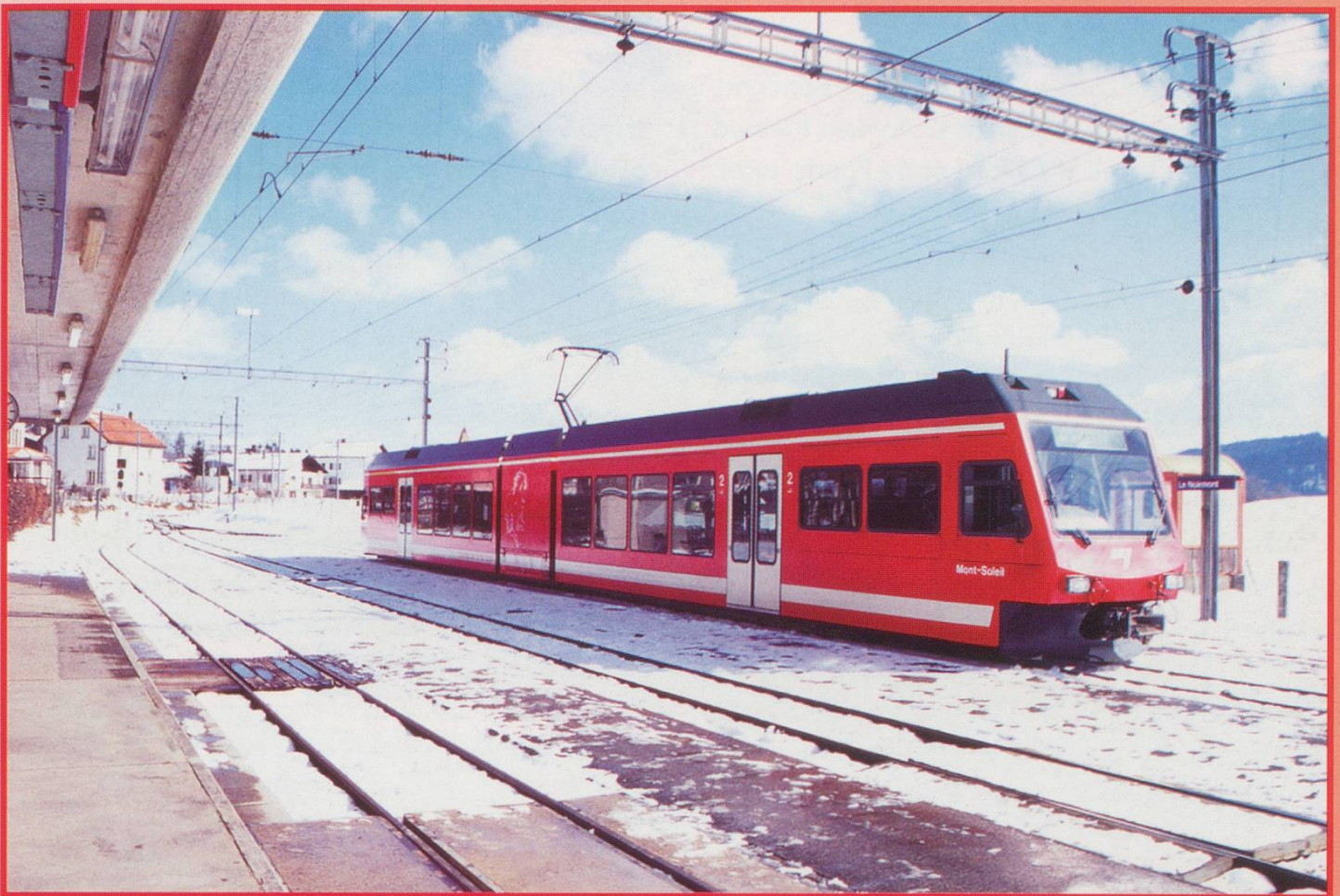
Chemins de fer du Jura GTW 633 arrives at Le Noirmont from Tavannes on 27.02.04, the final day of the trip.

now reaches a certain well-known hotel. Our next planned halt was at Klosters, packed to the brim with dreaded skiers, snowboarders and their equipment and our first class passes proved most valuable on the run down to Chur and our chosen restaurant. We returned to a ghostly quiet Luzern in the dark, a markedly different place from the two previous nights.