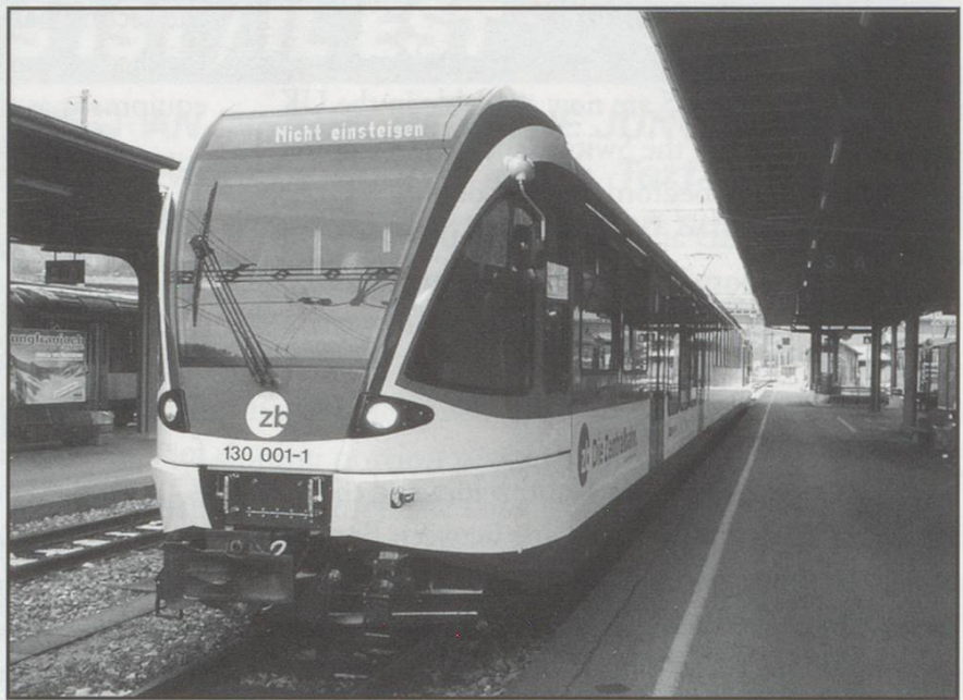
Some views of the new Zentralbahn corporate image.

The introduction of the Stadtbahn Zug services has not been without problems, so much so that SBB and ZBB had to issue a public apology on 2 nd February! A number of causes have been identified; these include an ambitious schedule in an already busy area, propagation of delays caused by the single track section between Cham and Rotkreuz, and a shortage of rolling stock, not helped by there being only 4 FLIRT units in service out of the planned 11. Adding to the difficulties, the FLIRT units have yet to be authorised for multiple operation, the first trials in passenger service being planned for mid-January but do depend on there being enough serviceable units. Due to heavy loadings on the S1 service from Luzern to Baar arriving Zug at 07:20, a relief S-Bahn service has been provided on Mondays to Fridays for the 8 minute journey from Cham to Zug, leaving Cham just ahead of the S1 service, which couldn't be strengthened because the FLIRT units could only work singly. The FLIRT multiple working trials were scheduled for a peak hour (morning outward, afternoon return) working from Luzern to Zug, the morning working being timed