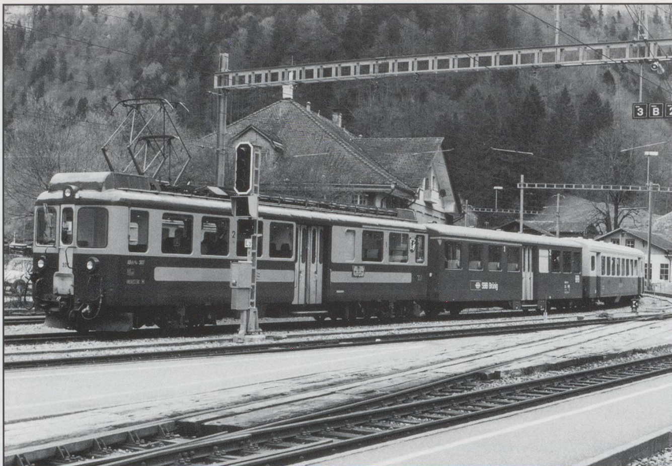
BOB 307 at Zweilütschinen preparing a rake of older stock, including a centre-entrance SBB Brunig coach and 'first-generation' modern coaches, to cope with the mid-day peak traffic flow. This was just a few days before more modern accident-victim stock was returned to the railway following rebuilding, so was a very timely photograph.

the 1986 built BDt driving trailers were parked out of use. When compared with what is now happening on SBB (ICN EMUs, intercity with Re460 at the back or in the middle), the BOB is almost more like loco haulage.