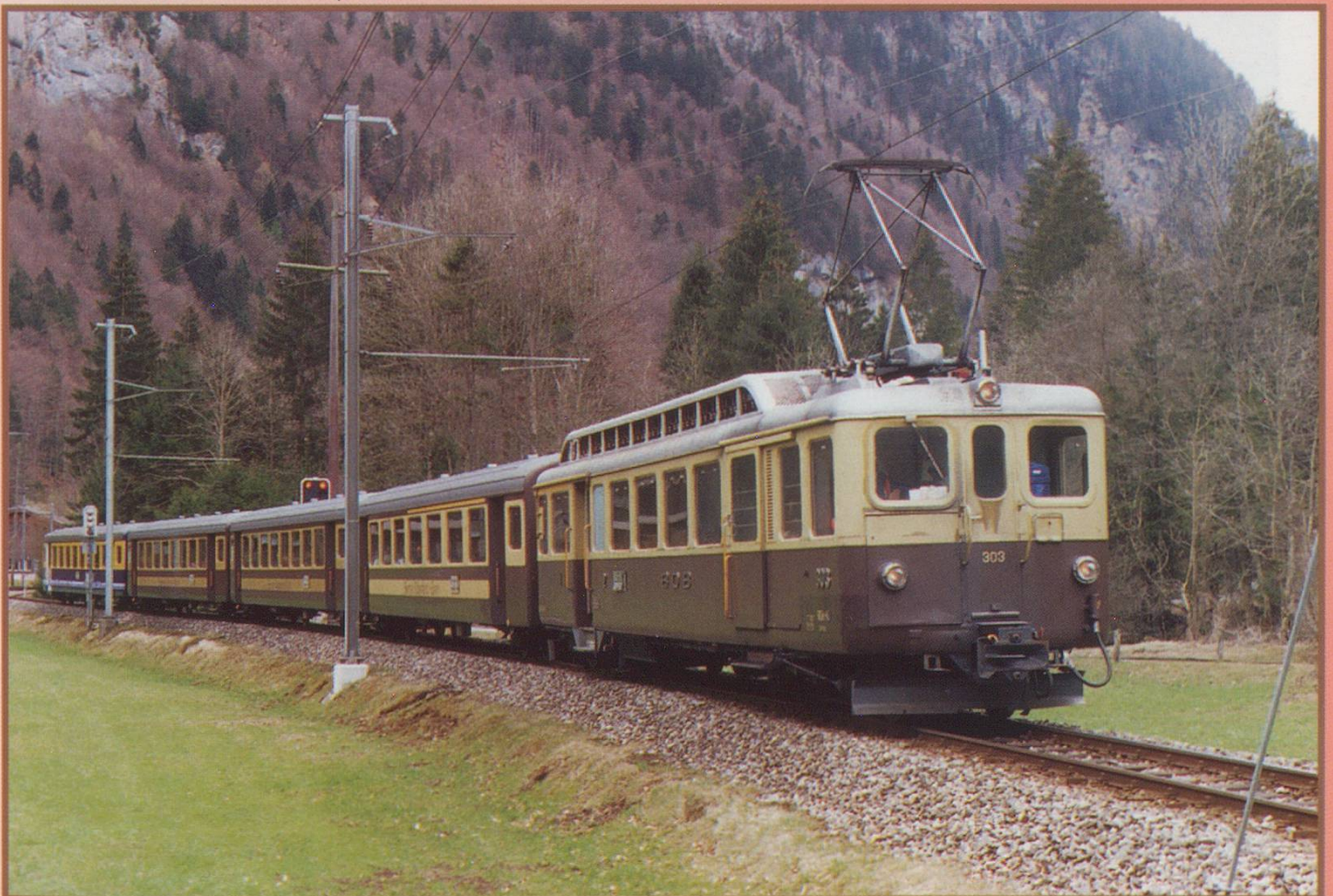
BOB 303, one of the 1949 units which were delivered at the time of electrification arrives at Zweilütschinen with a Lauterbrunnen - Interlaken portion. 06/04/04

Often dismissed as boring, due to its regular interval operations, I came to the conclusion that BOB operations are 'samey' but far from boring. First of all, despite not being a loco hauled service, the BOB traction units (ABDeh4/4 or ABDeh 4/4) act very much like locos, and despite the presence of driving trailers, many trains are formed in 'loco and coaches' style. Indeed one day I was there, all of