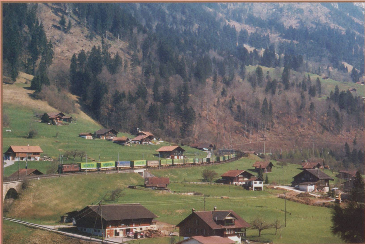
A BLS Re4/4 banking a heavy container train away from the camera uphill towards Kandersteg. The train locos (2 BLS Re465s) are hidden round the bend. Schloss Tellenburg, April 2003

Although the BLS 'main line' is no longer a procession of traditional brown BLS locos, the hourly Bern – Neuchâtel express services are currently diagrammed for Re4/4 locos.