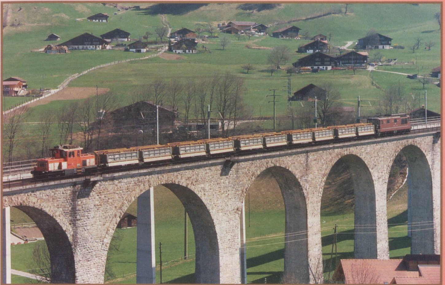
BLS178 shuttles to and fro topping and tailing with a diesel shunter on Base Tunnel shuttle works trains.

the cost of individual train and boat tickets, and purchased by 'foreign' credit card in a few minutes. Waiting for the train we witnessed a very amusing exodus of national service youths from the small military compound adjoining Boltigen station car park. All the cars in the car park which were mostly 'boy racer' models turned out to be not commuters' but belonging to these young squaddies, and from most cantons. They raced off in all directions to go home to their corner of Switzerland! The non-car owners crowded onto the station platform, but luckily they boarded the eastbound Regio EMU preceding our RX. In another very 'Swiss' scene, a select few, speaking French, were left waiting for a Zweisimmen-bound Regio to get them back to French speaking territory! We took the 1210 RX2369 Goldenpass Panoramic to Spiez with 257. Proof that the ticket does not distinguish between modes was that on rising to alight at Spiez, the gripper said "no-no this train goes to Interlaken". We responded "but we're going via the boat"! We had MV Niederhorn from Spiez to Interlaken,