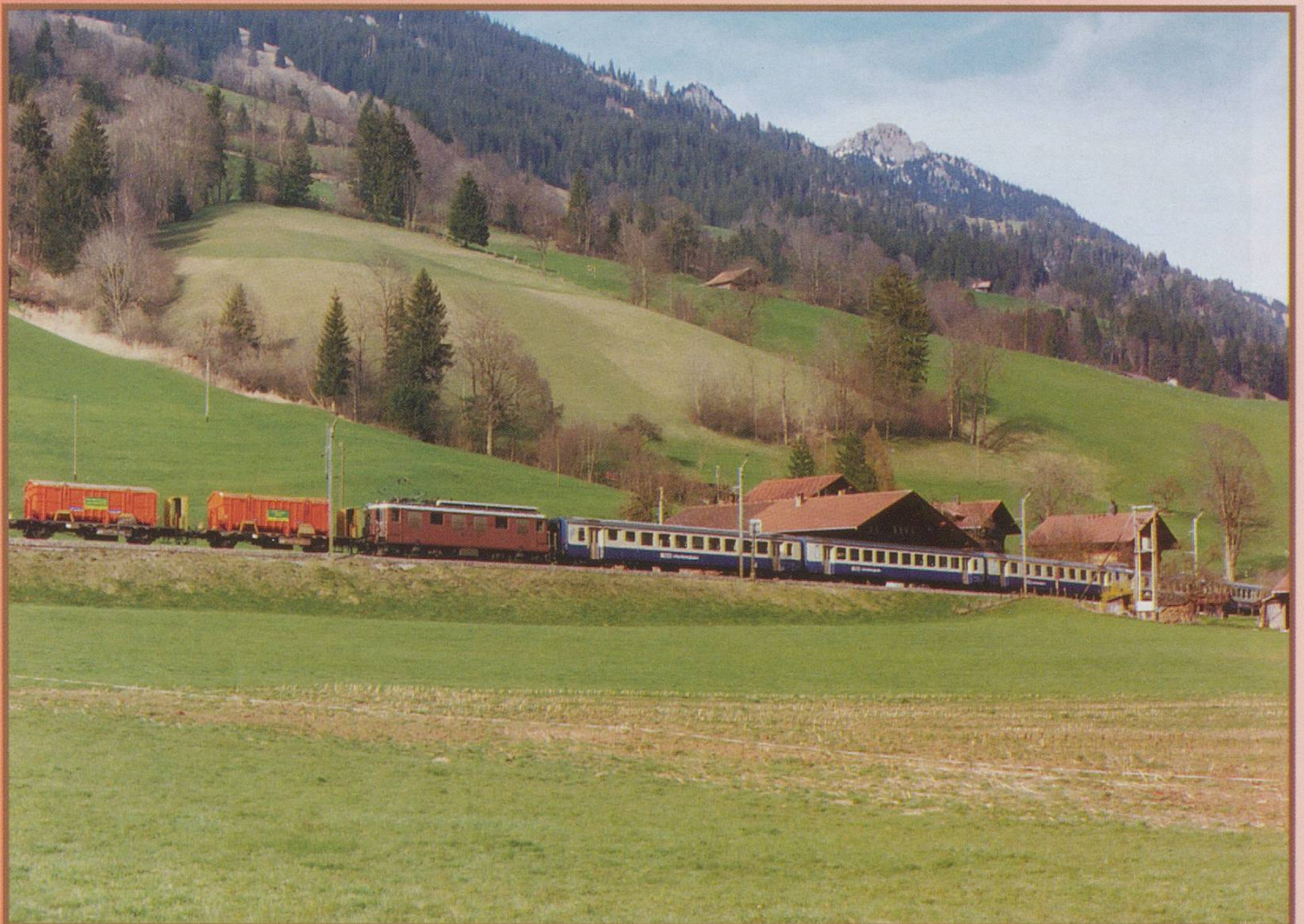
BLS Ae 4/4 pushing a standard push-pull set, whilst also towing 'binliner' container wagons, downhill from Zweisimmen to Spiez, at Reichenbach. April 2003

One of our excursions was to Interlaken. The friendly ticket clerk-cum station master at Boltigen (the only booked intermediate stop for the RX's) issued us a Boltigen – Interlaken return, valid via train or lake, for a lot less than