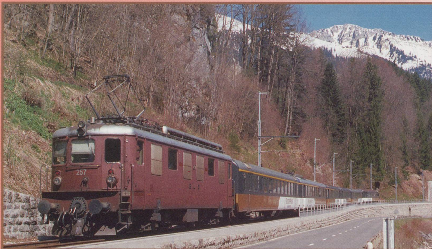
Ae4/4 257 brings up the rear of the 'Golden Pass Panoramic' push-pull set as it heads down the valley from Boltigen forming RX2369 Zweisimmen 12h21 - Interlaken Ost 13h24.