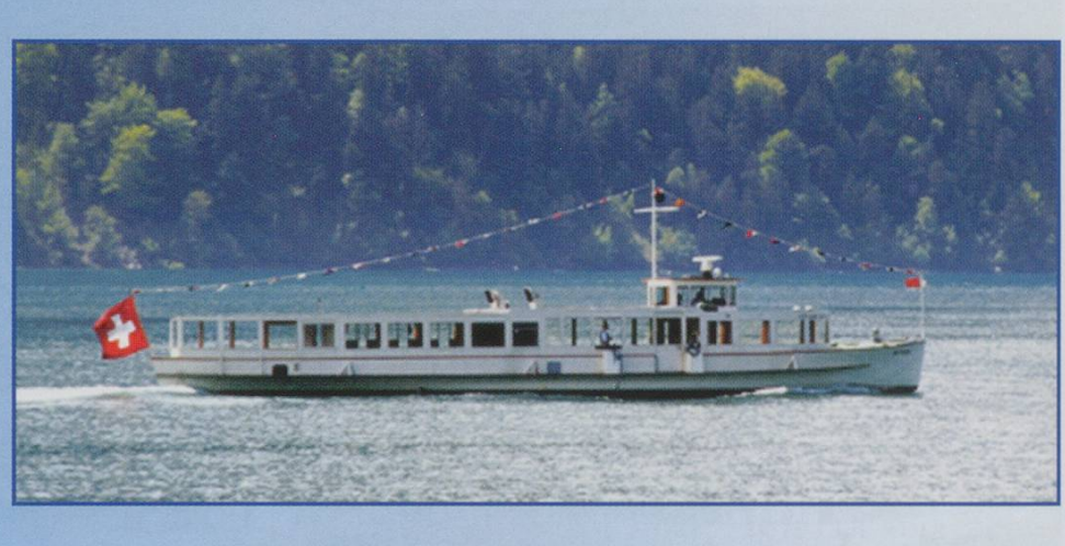
"Mythen" arrives to greet the paddle steamers