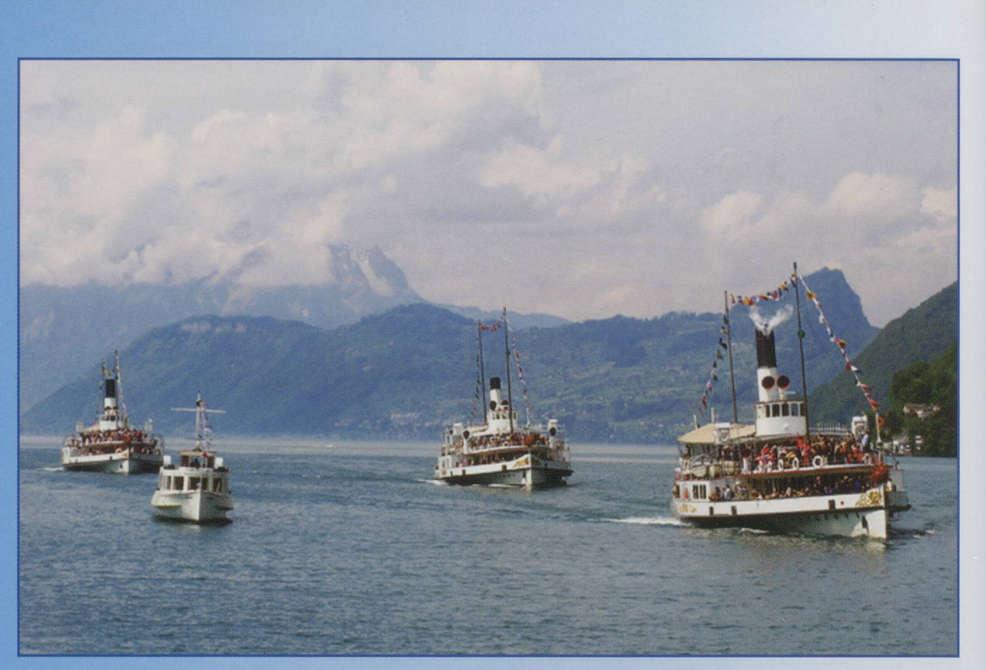
"Mythen" moves into position to head the procession at this part of the lake