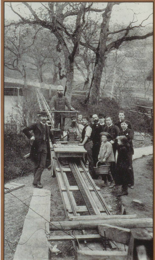
The experimental line at Territet with fascinated spectators