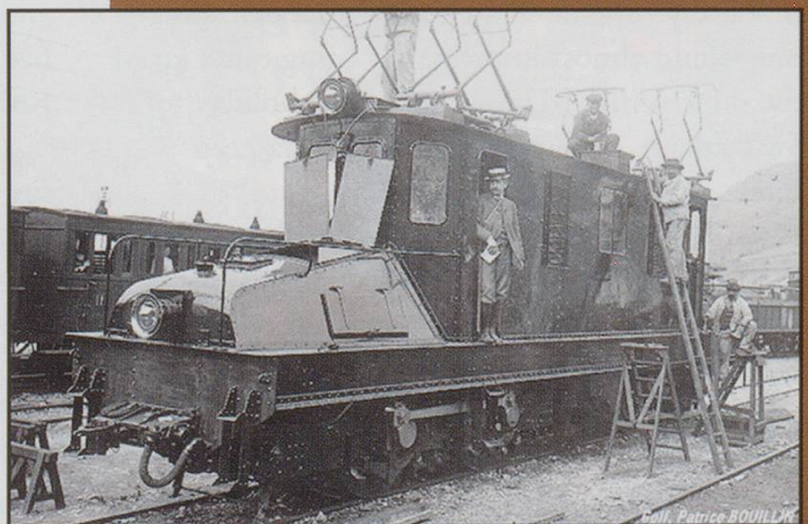
One of M. Thury's 'High Voltage' locomotives for a later French line.